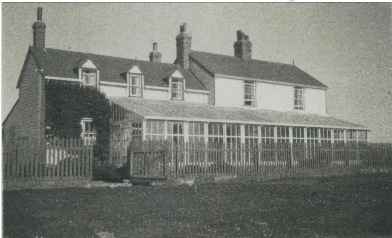
Top: Fitzroy house and conservatory, April 1929

The Gwendolin made a trip to Fitzroy in October 1921 with sundry material collected from Sullivan House including the glass house. The carpenter at Fitzroy erected it as a conservatory during off times and by March 1922 it was completed. [D13; pg 705, 788]