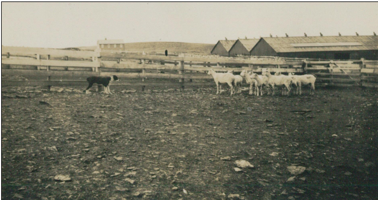
Fitzroy woolshed

In 1928 the Fitzroy woolshed, supplied by William Bain & Co Ltd, was built at a total cost of £5,048. [FIC/ZD1; pg 24]