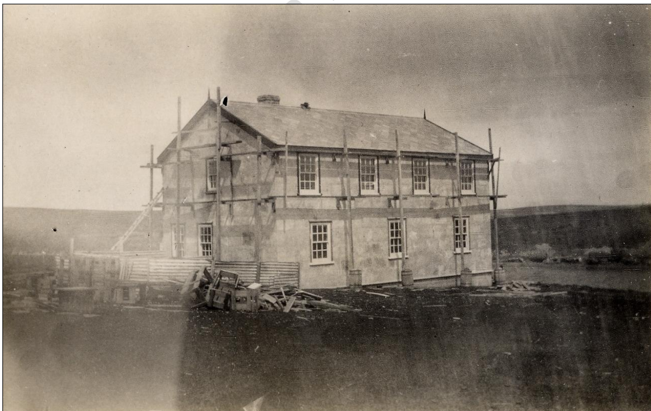
New cookhouse being built at Fitzroy

The Fitzroy cookhouse, valued at £400 when conveyed in 1921, burnt down in 1930. [FIC/ZD1; pg 19] Rat Castle was empty so it was used as a temporary cookhouse until a new cookhouse was built. The new cookhouse was completed in 1931 at a total cost of £1,110. [FIC/ZD2; pg 75]