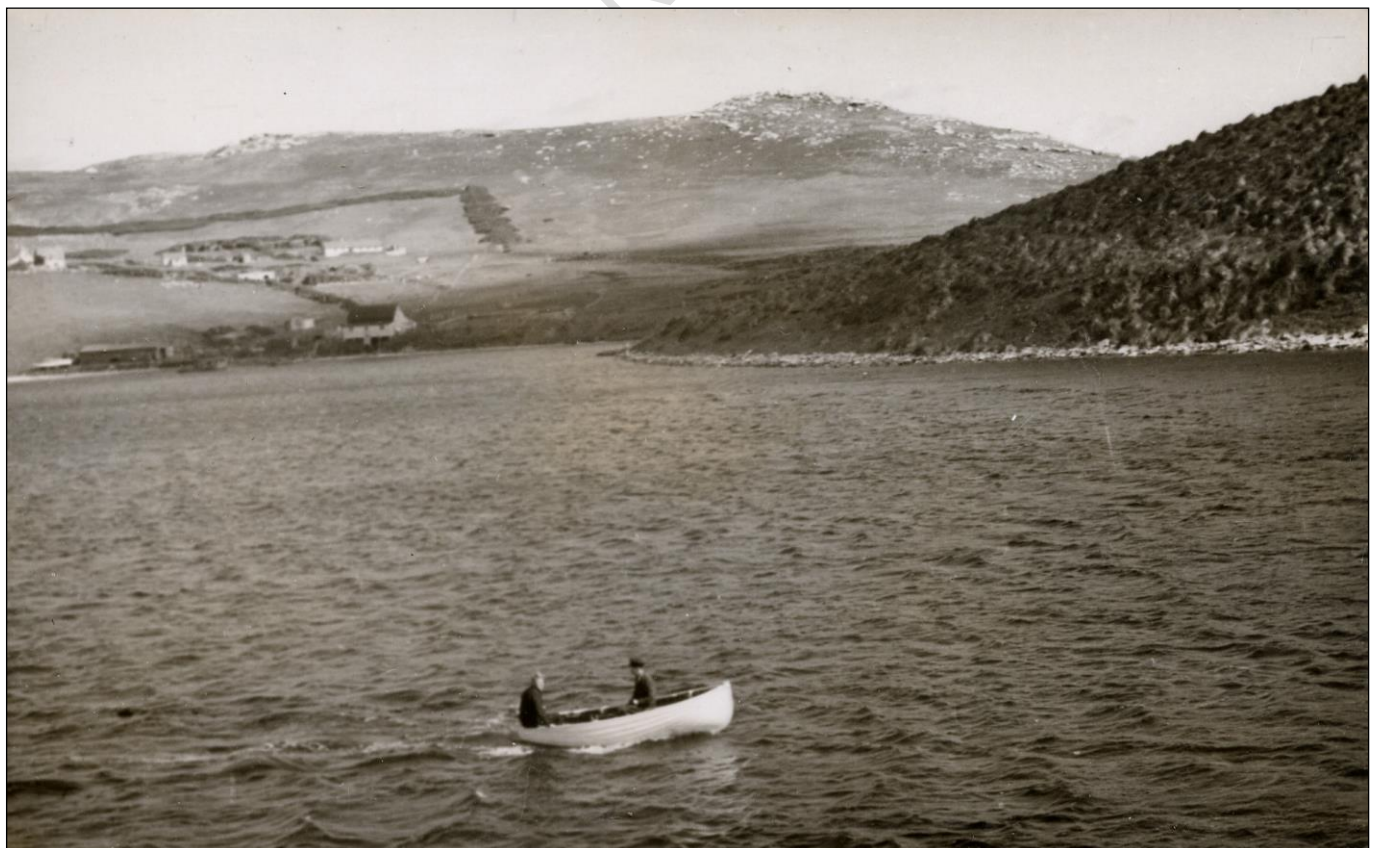
West Point Island Settlement