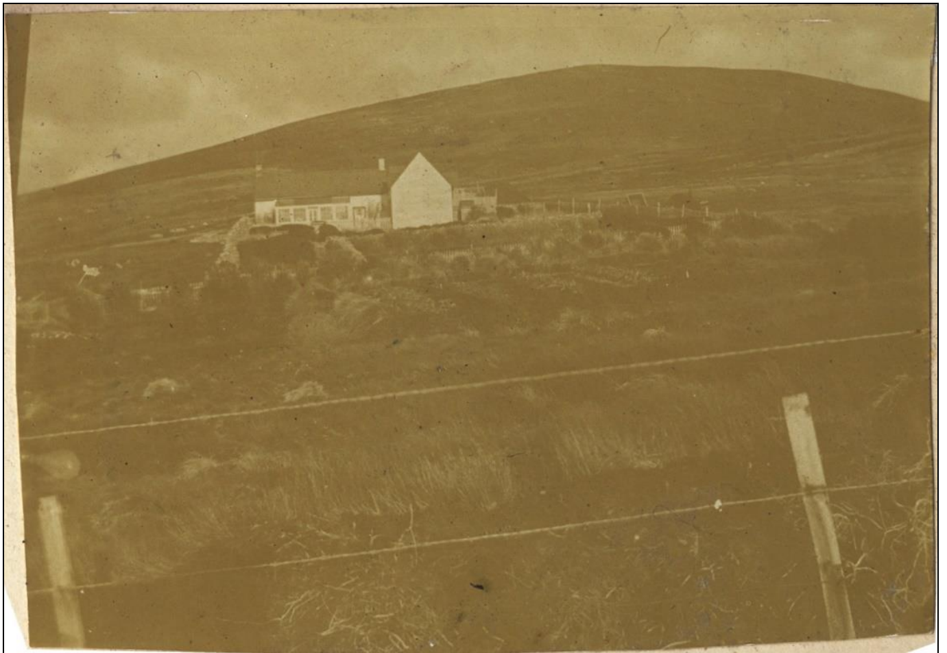
Manager's House West Point