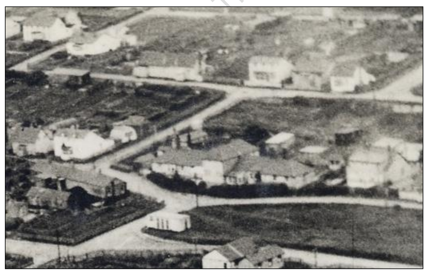
Late 1940s – Third house from right, top row