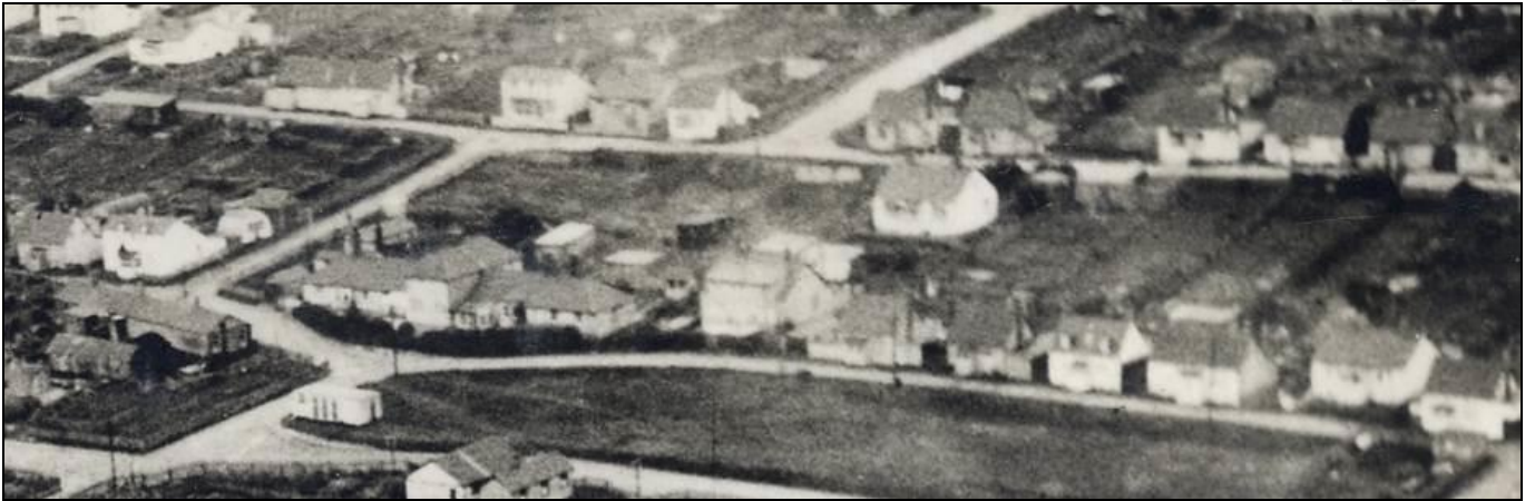
Late 1940s – Sixth house from right bottom row