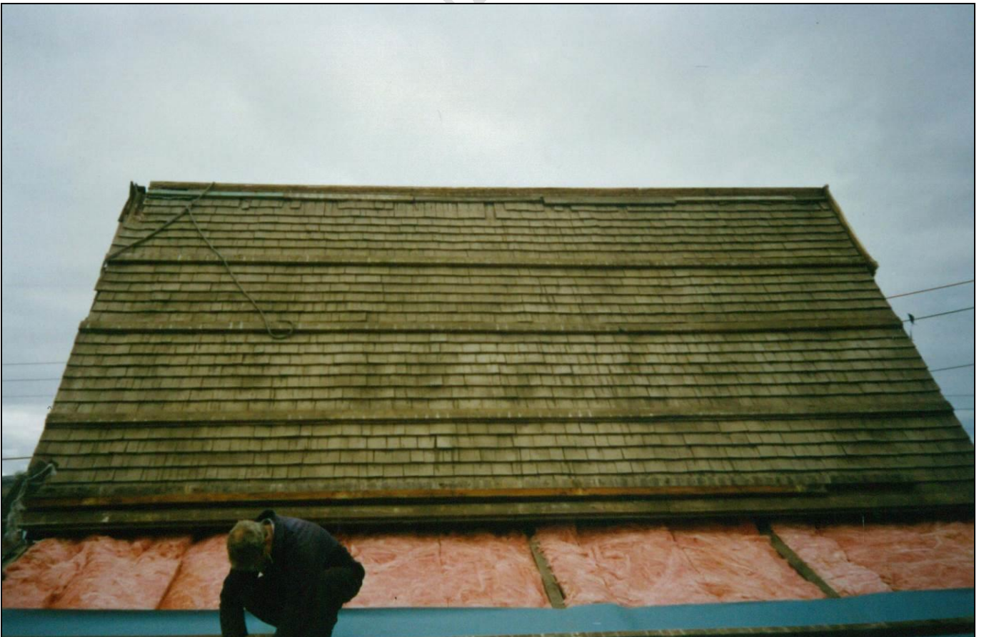
1990s – The original shingled roof and the lean-to being prepared for re-roofing