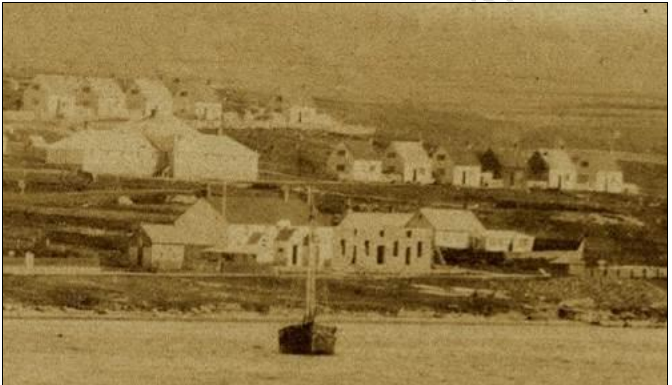
1863 – Sixth house from right middle row