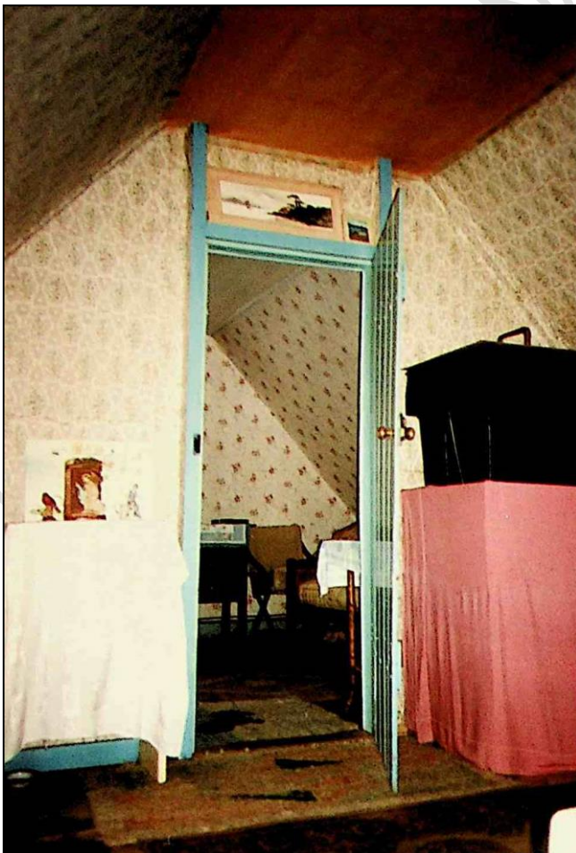
Looking through from the first bedroom to the second bedroom