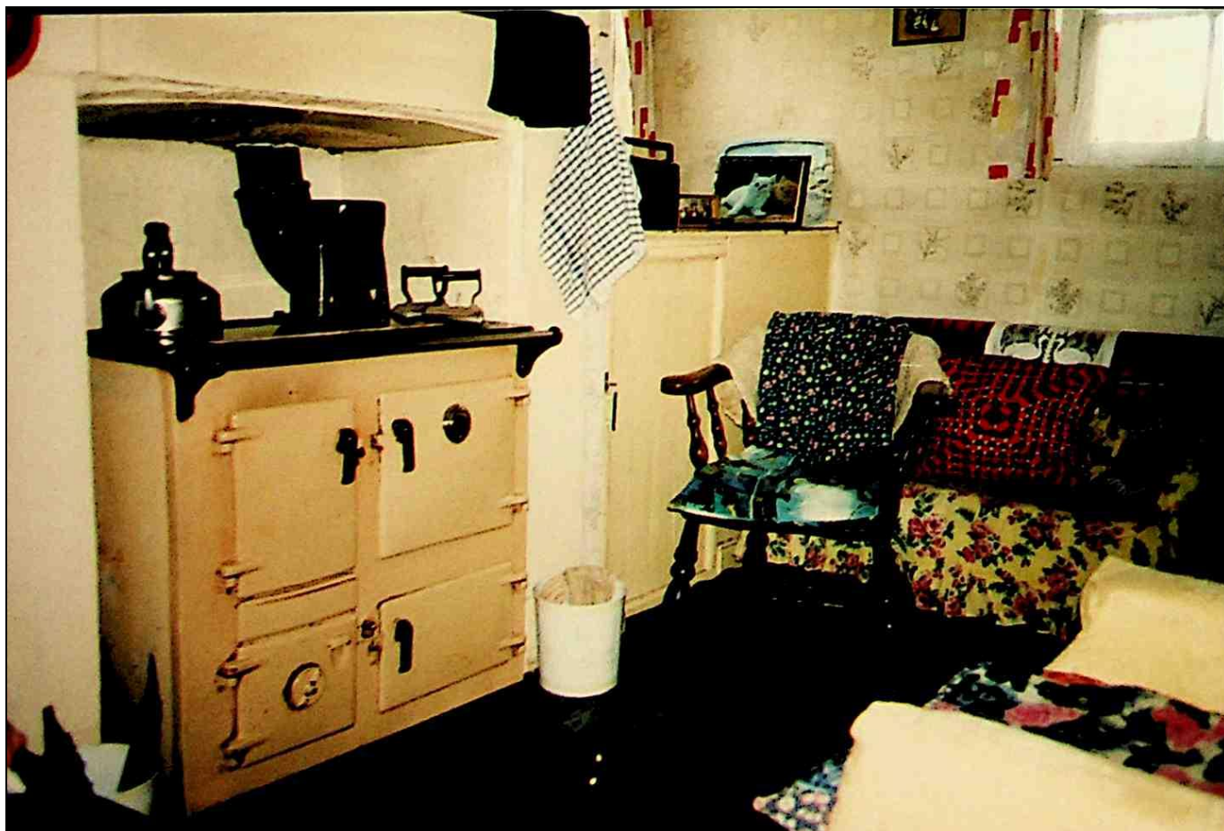
Kitchen with traditional range