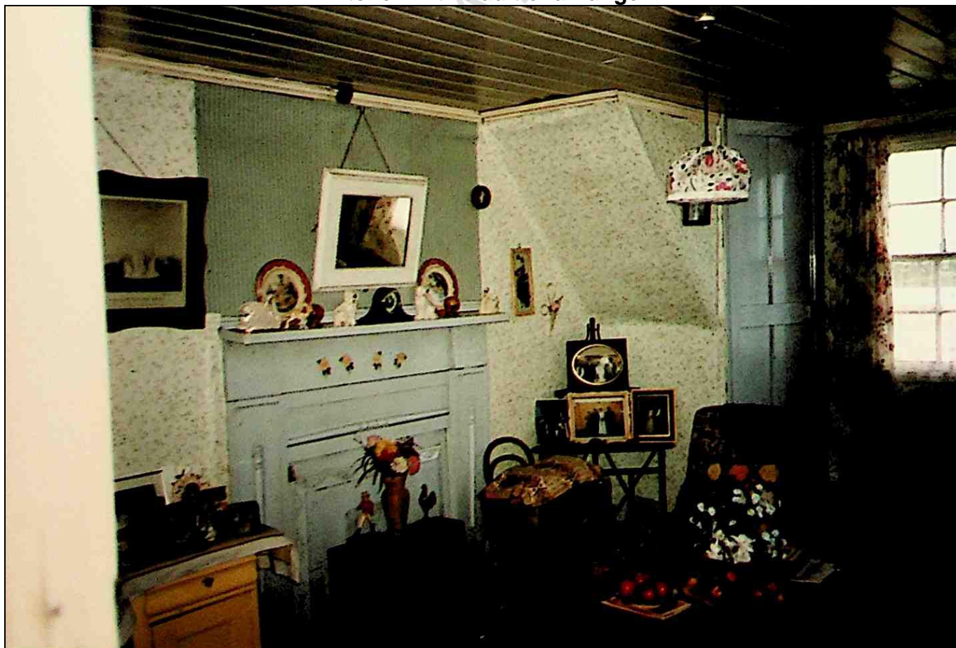
Lounge with door to stairs next to the window