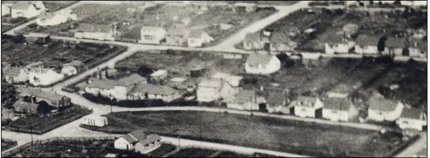
Late 1940s – Sixth house from right, top row