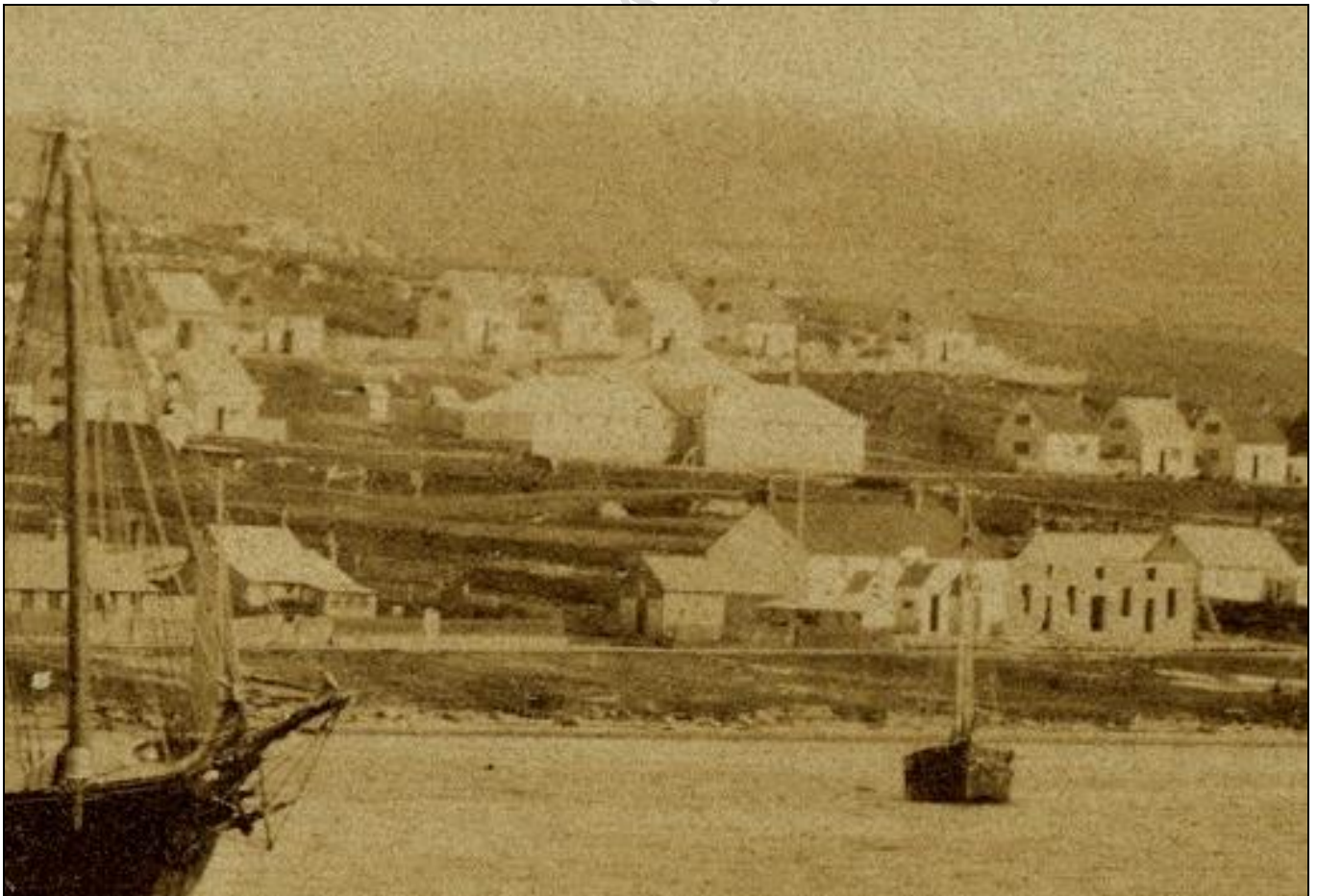
1863 – First house from the left, top row