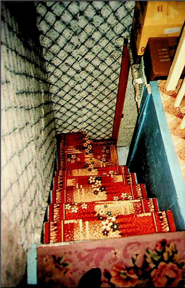
Looking down the stairs