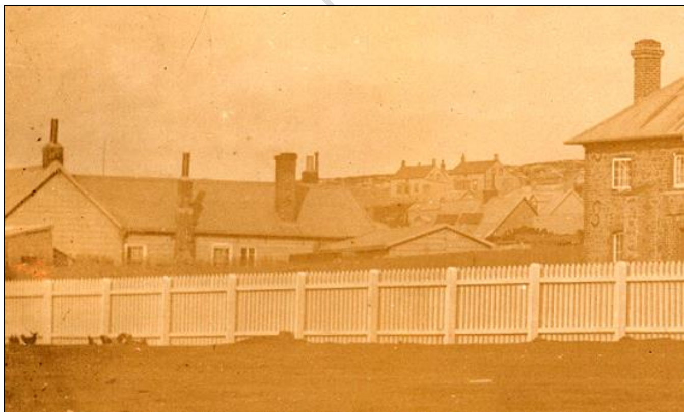
The old Deanery

In May 1855 the Deanery was described as a wooden house nearly opposite the guardhouse but on the south side of Ross Road "It consists of a cottage fronting the Ross Road 28 feet long by 16 feet wide, divided into two rooms and a lobby. To the south at right angles another wooden building is hipped on about 36 feet long and 14 wide containing a kitchen 14 feet square, bedroom 8 x 14 and hall 14 feet x 12. The front is divided into a sitting room 17 feet x 15 ft and bedroom 15 feet by 10 ft. The register stone mantelpiece, fender fire irons and cupboards belong to the Government – the other articles in the house to the present tenant the Revd Mr Faulkner, as also the kitchen grate & fixtures in the kitchen. A small wooden building on the west side of the kitchen detached from the house belongs also to the tenant.