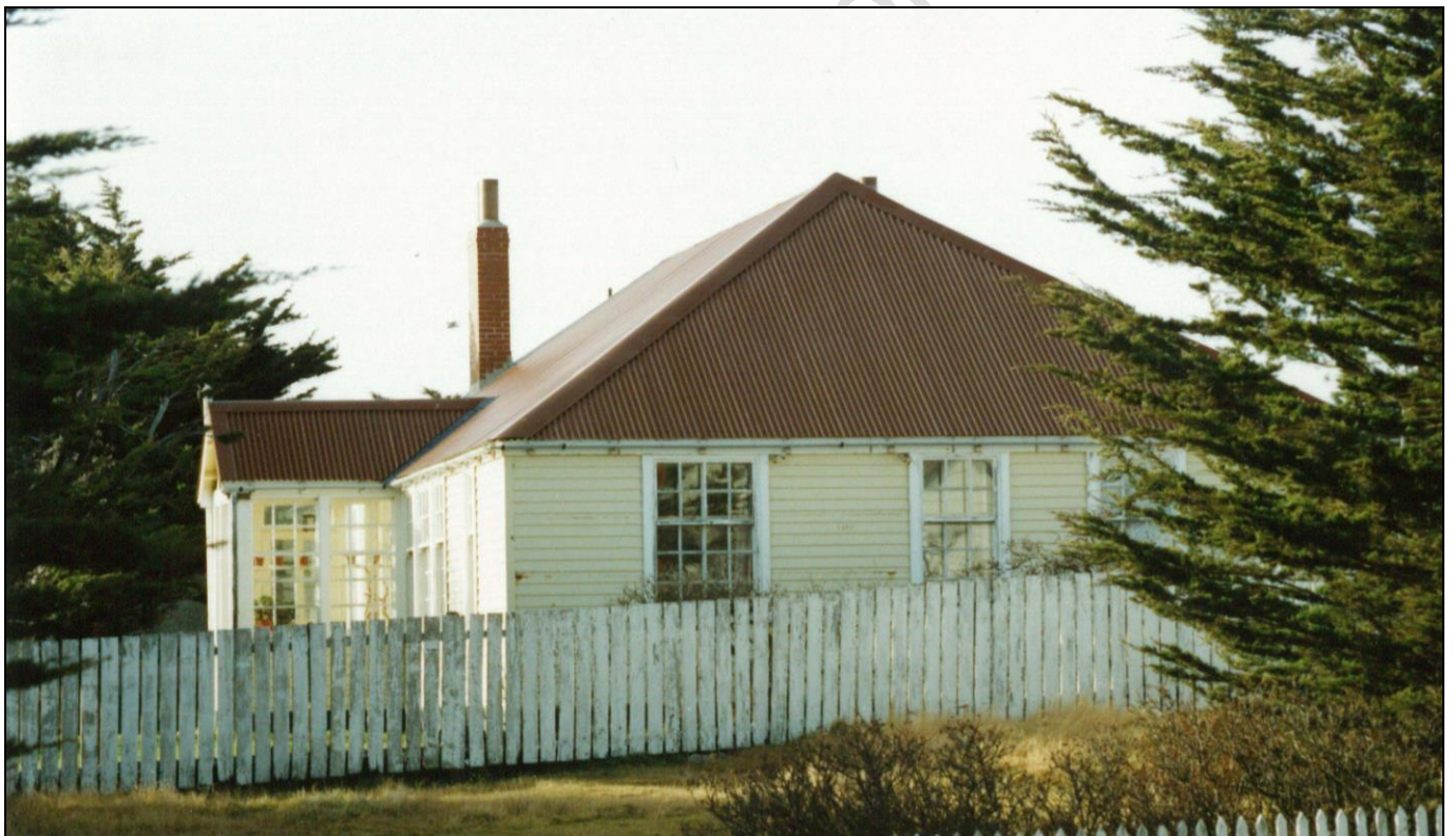
Second Deanery 1992

The second deanery was demolished in 1997 to make way for the present Deanery, built in 1997 and also a kit house.