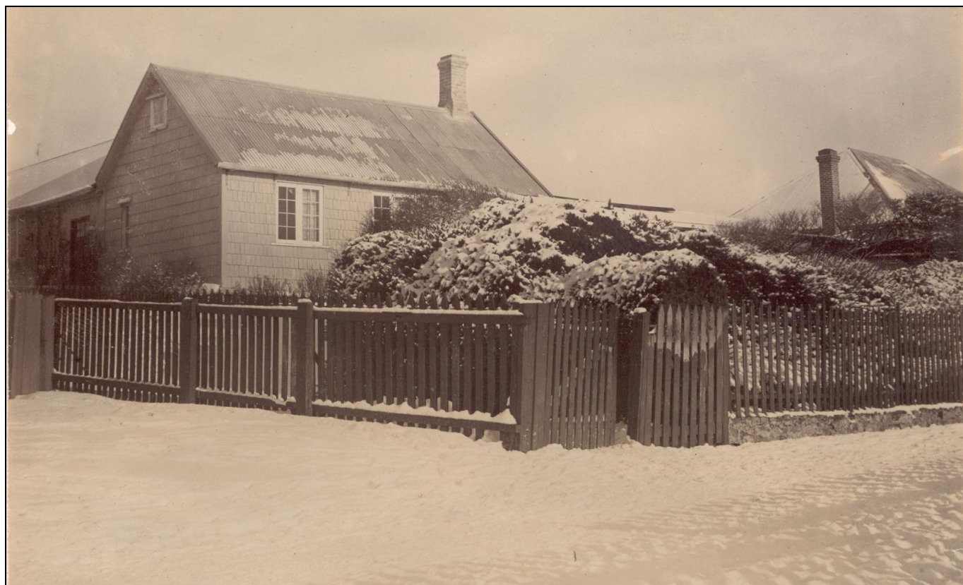
The old Deanery