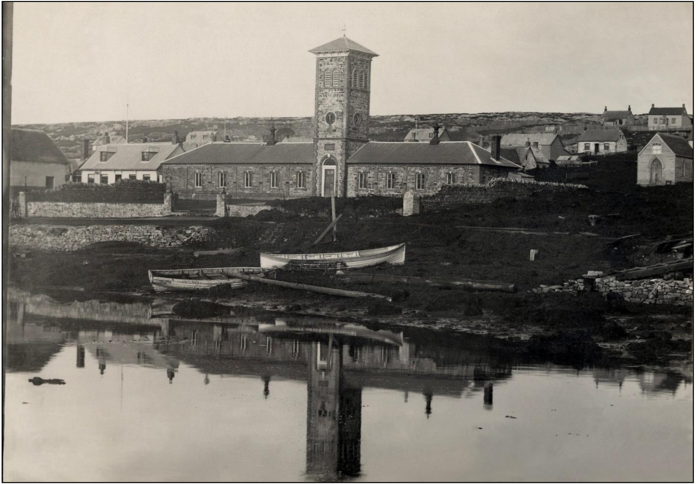
Peat slip behind the Exchange Building – Infant School to the far right

During the night of 2 June 1886 a peat slip occurred when “a stream of half liquefied peat, over a hundred yards in width and four or five feet deep, flowed suddenly through the Town into the harbour, blocking up the streets, wrecking one or two houses in its path, and surrounding others so as completely to imprison the inhabitants.” In August 1886 the Governor reported “that so great a mass of peat was pressing upon the south wall that it had cracked in several places under the weight, and had this not been speedily lessened by cutting across and draining the mass, which could not be altogether removed, the whole structure must soon have fallen. This was prevented, and the walls supported by shores, but it was impossible to use the building any longer, and a builder and mason by whom I have had it examined reports it in a dangerous condition, the campanile or central tower being three feet out of the perpendicular.” It was suggested that the site be granted for the erection of a church and they could use the materials of the demolished building.