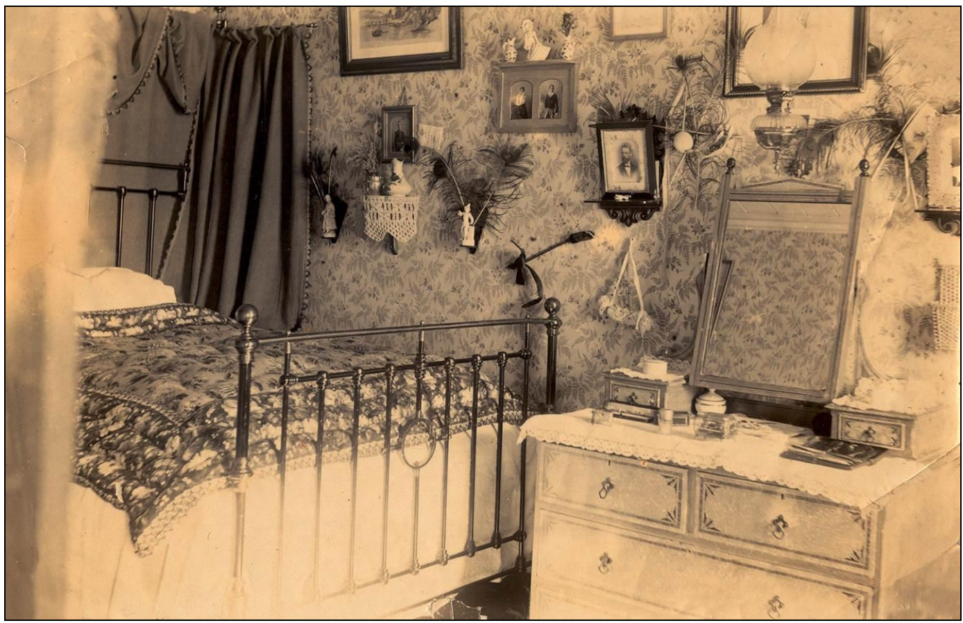
One of the bedrooms