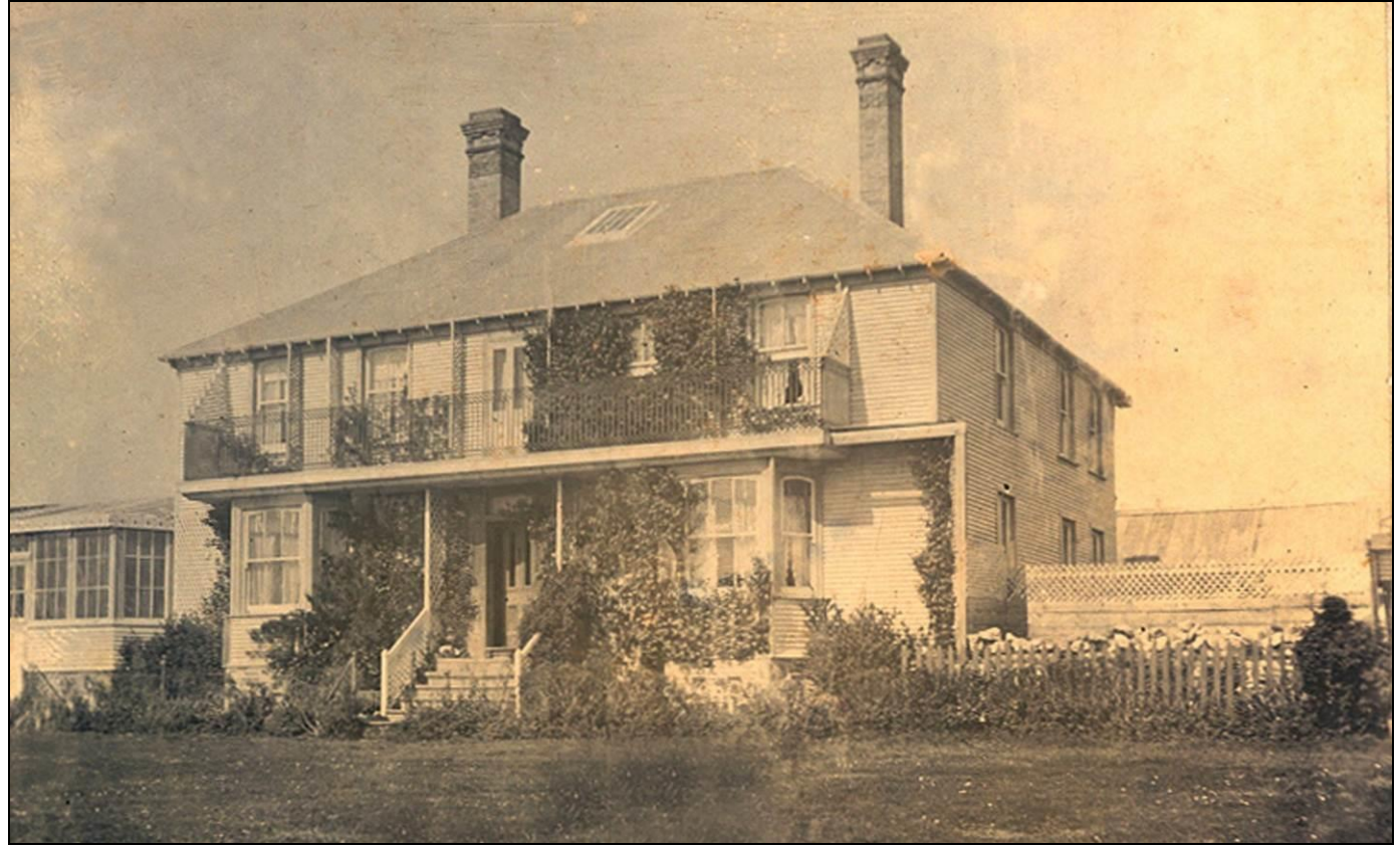
Malvina House circa 1900