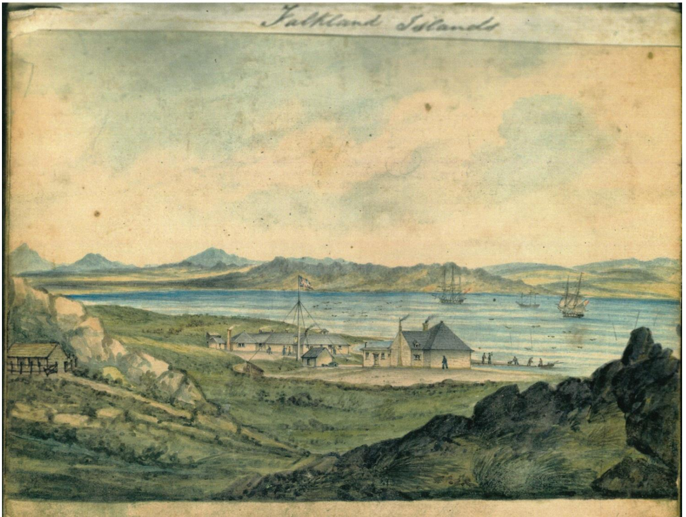
Looking north from Magazine Valley: The Offices to the west and Government House to the east probably painted circa 1845 – FIC Archives, JCNA

Erected in 1844 and originally the first Government House in Stanley; a single storey wooden building to the north-west of the current house. It served as a combined office and dwelling house until 1847 when it was used for residential purposes only. After 1859 when Governor Moore moved to the present Government House the original building was used as offices and later taken over by the Colonial Secretary and known as The Quarters.