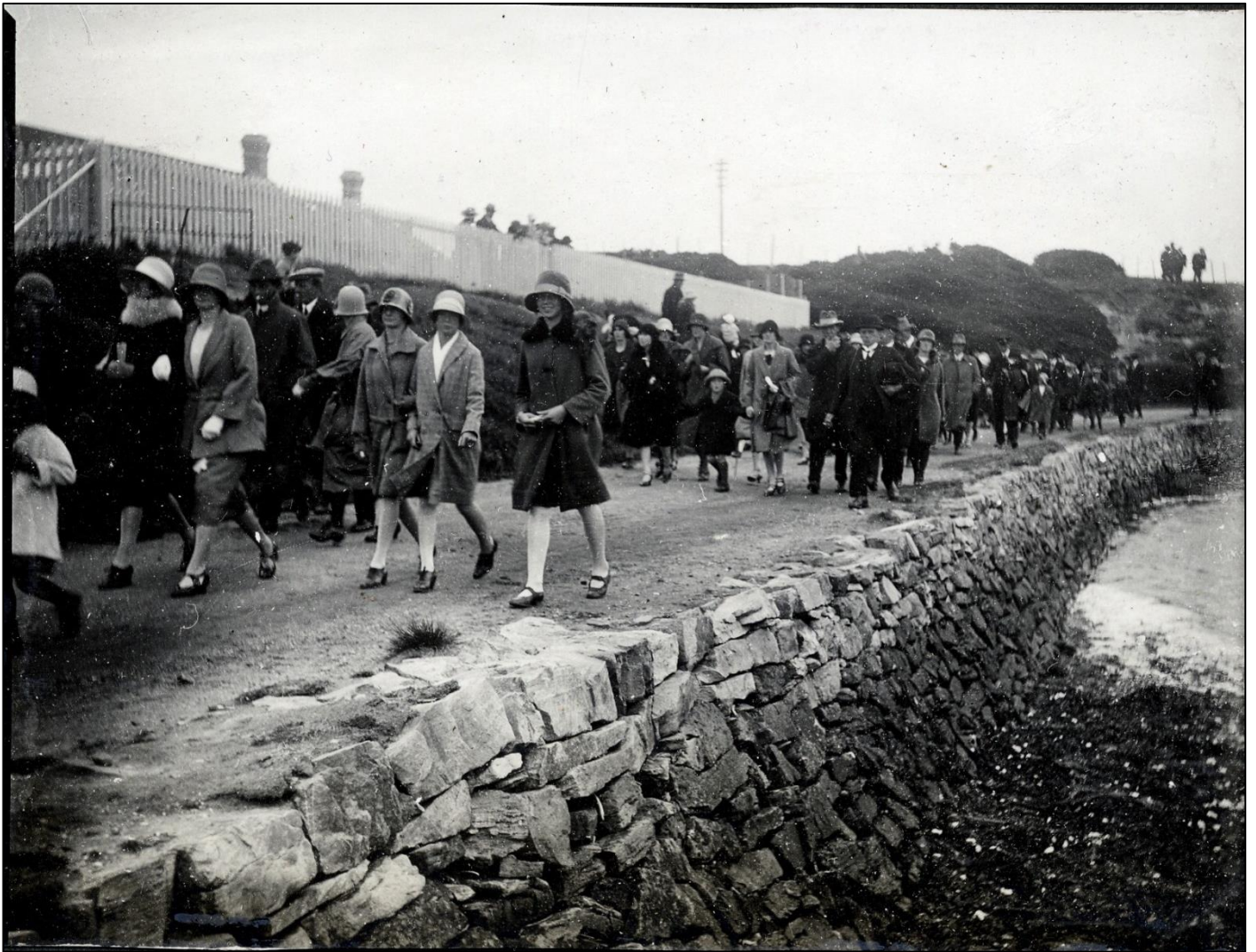
The Quarters 1927

In 1929 The Quarters were sold by public auction, pulled down and partly re-erected at 5 Brandon Road. [GOV/GHO/2#9]