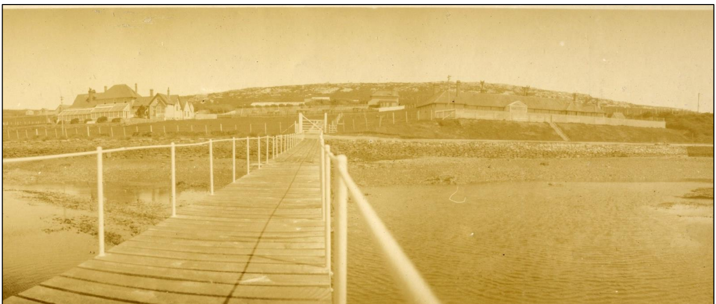
The Quarters 1926 – FIC Archives, JCNA

In July 1916 The Quarters normally occupied by the Colonial Secretary consisted of 8 rooms and were occupied by H W Townson, the Stock Inspector, at an annual rental of £40. On 1 January 1917 The Quarters were insured for £600.