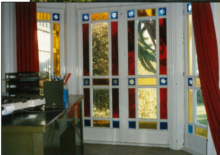
Stained glass in front windows