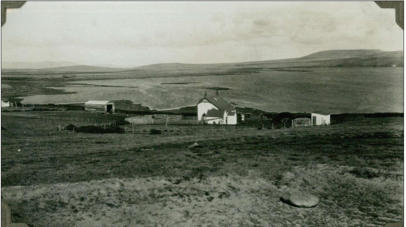
Chartres settlement on The Point

During 1903 the Chartres River Station settlement was moved further down the creek to The Point to ease shipping movements as the heavily laden schooners had problems clearing the bar. [FIC/EC/CHA/1#2]