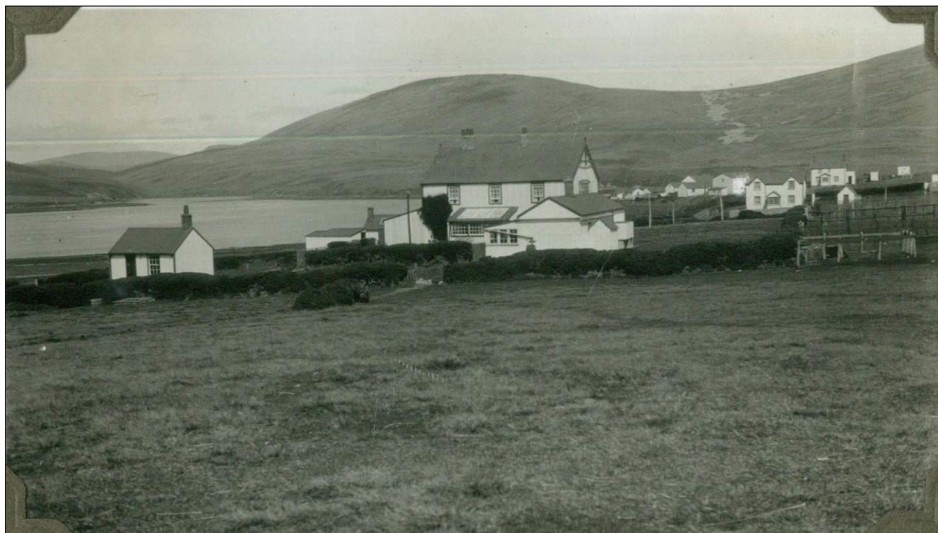
Chartres settlement

In 1946 it was recommended that an Army Nissen hut was sent to Chartres to be used as a school. This was sent out in 1947 and the foundations prepared but the erection was delayed by the non-arrival of two of the sections. [C2/45]