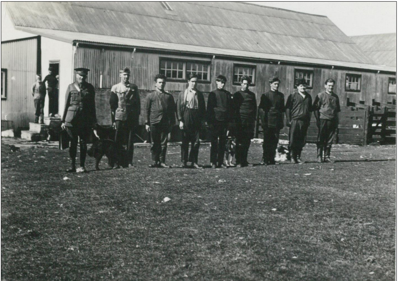
New recruits for the FIDF from Chartres settlement – JCNA

In April 1923 a bridge was suggested over the Chartres River. A drawing was submitted in April 1924 with an estimated total cost of the bridge being £550. By August 1927 this had increased to £670. The gang arrived at Little Chartres 21 March 1928 and the new bridge over the Chartres River with a span of 120 feet was completed 10 April 1928. [TRN/LAN/1#14: Annual Col Report 1928]