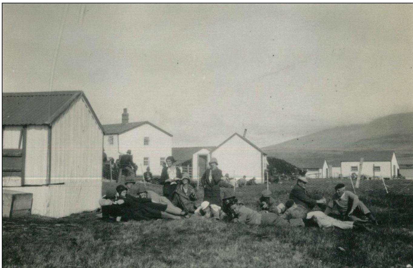
Chartres sports circa 1932/33