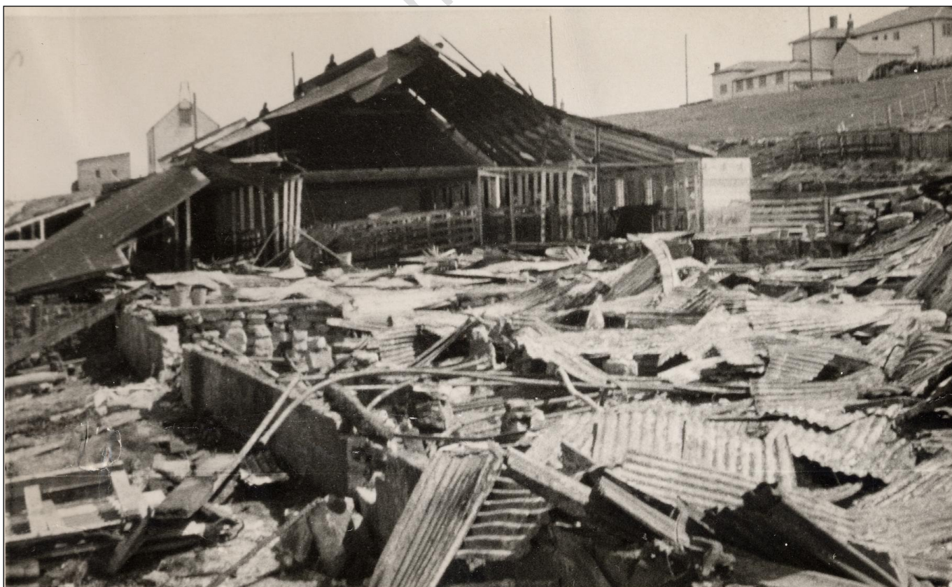
Aftermath of the woolshed fire at Port Stephens

The Hoste Inlet house and the South Harbour house were demolished in 1958. A new hay barn was built in the Port Stephens settlement at a cost of £719-7-7. [FIC/ZD2; 210; 213; 216]