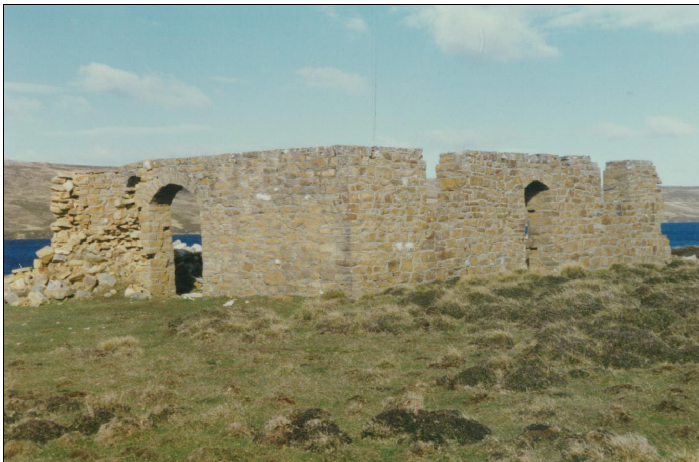
Old shearing shed Port Edgar, 1997