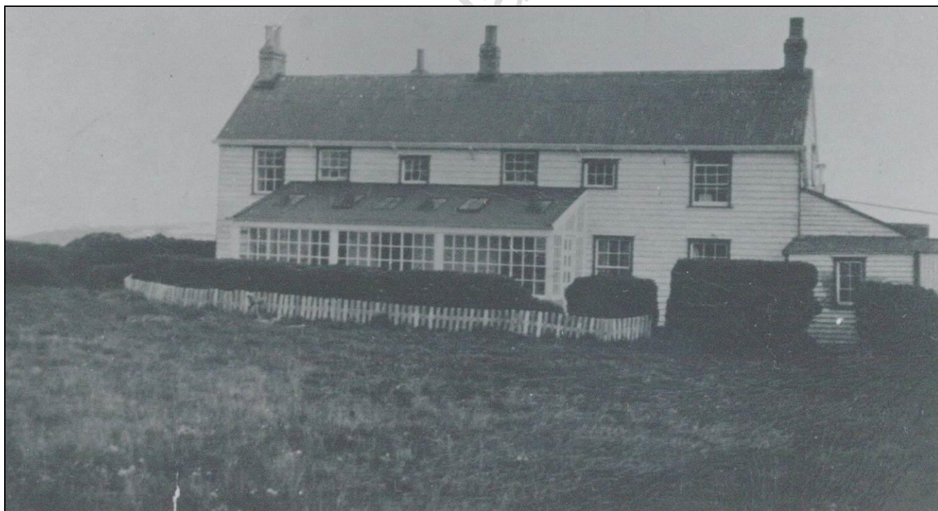
Old manager's house, Port Stephens 1940s

A new settlement house was built in 1950 at a cost of £1,521-12-3. [FIC/ZD2; 214]