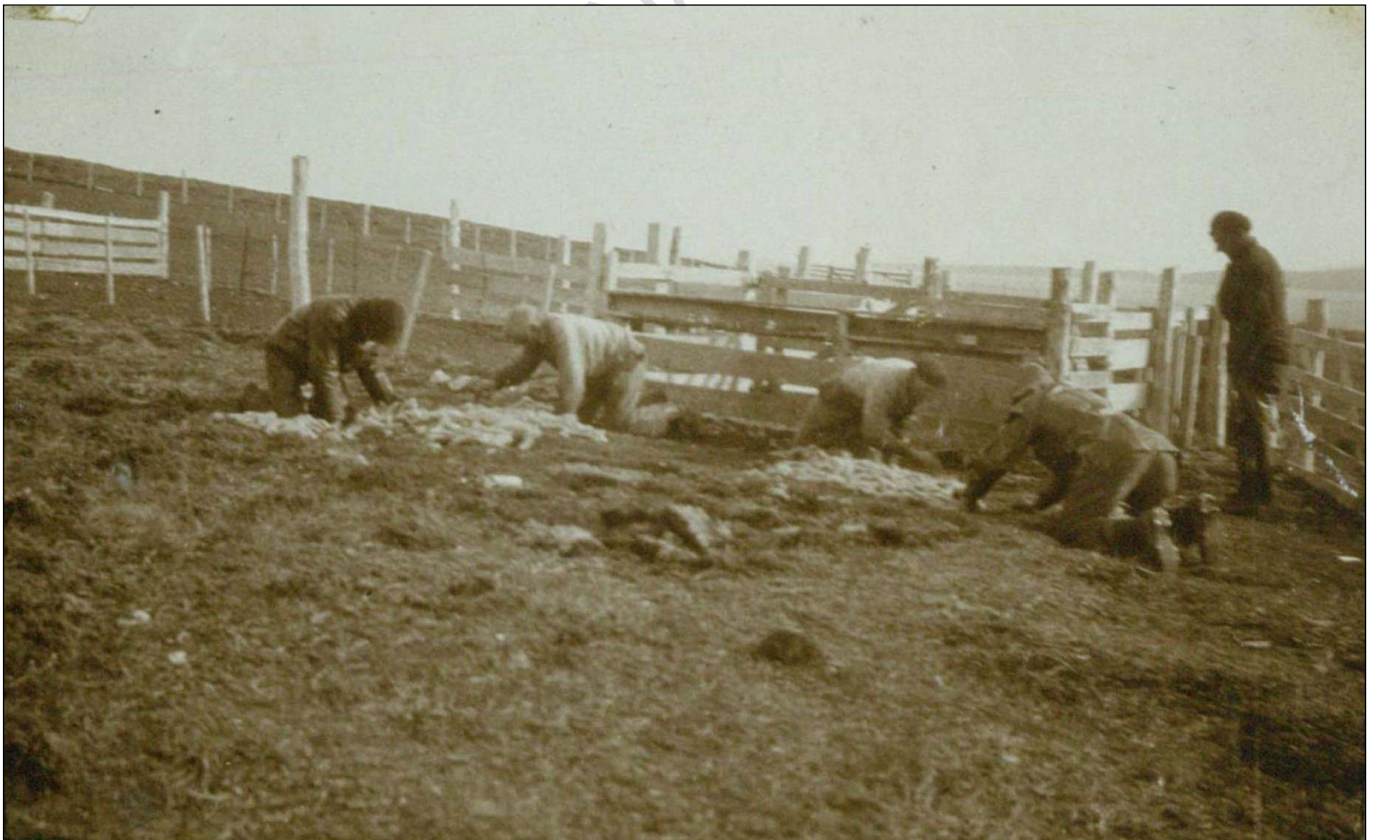
Bun, Jack, Vincent & Jim counting tails at Dunbar 1932. C Poole standing – Clement family albums

Roy Cove was purchased from Bertrand & Felton Ltd by the Falkland Islands Government in July 1981 for £200,000 and sub-divided in 1982 into six sections: Boundary 9,173 acres; Crooked Inlet 13,654; Dunbar 14,891 acres; Hope Harbour 16,876 acres; Picthorne 11,684; Port North 8,738 acres.