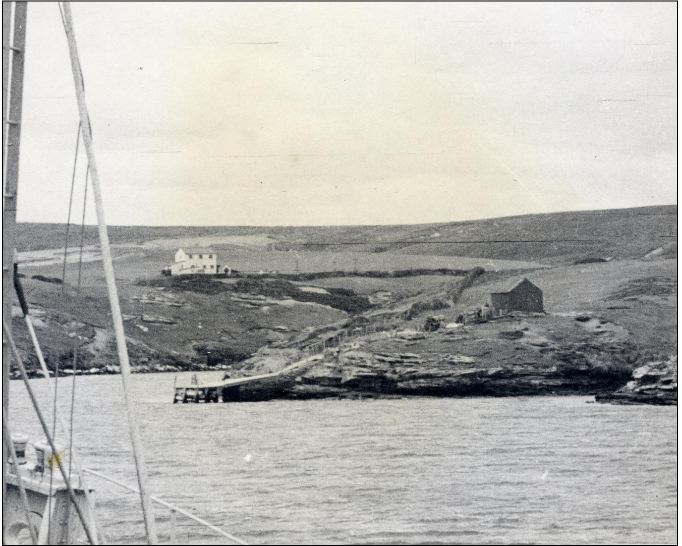
Roy Cove Settlement from the sea