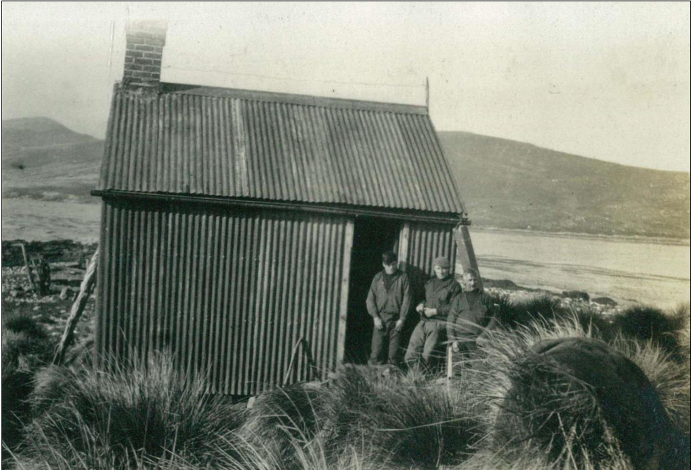
Bense Island Shanty 1928 – Clement Albums

On 5 February 1872 under the 10 th clause of the Amalgamation Ordinance of the Lease of Crown Lands of 1870 William Wickham BERTRAND transferred the portion of land bounded “on the South East by Station Nos. 6 & 7 from Teal River to River Harbour. Thence on the North and North East by the shores of River Harbour, Rock Harbour, Port Egmont and Byron Sound to Hill Cove. Thence by a line running South 39° West to the North East arm of Crooked Inlet, and containing 109,720 acres more or less, together with Tussac Island and Middle Island, and other small islands as delineated by a line of demarcation inscribed on the Chart recorded in the office of the Surveyor General” to Messrs HOLMSTED and REES who were granted a lease for 21 year from 5 February 1871 at an annual rent of £111 for the first 10 years and £184 for the remainder. [BUG-REG-2; 277]