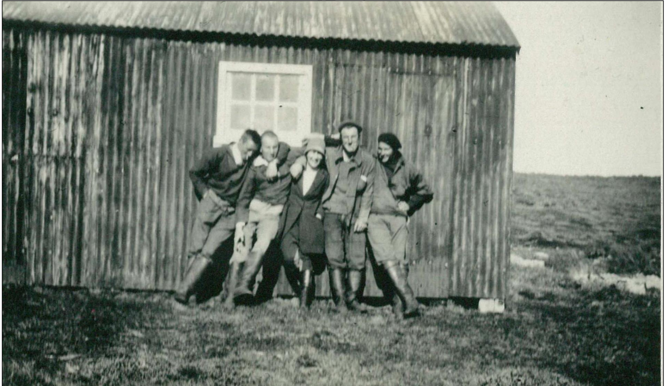
Rabbit Island Shanty 1929

On 5 February 1889 there were 4 houses in the Roy Cove settlement and 24 inhabitants. The Port North house was built overlooking Port North and had 2 adults and 5 children. The Dunbar House was built overlooking the sea and had 2 adults and 6 children. [H43; 52]