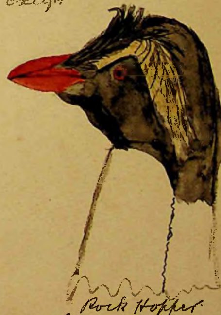
Macaroni Penguin Catarractes chrysolophus