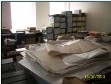
Part s of the JCNA workshop after completion of the removal of the FIC records to the Archives

This last sentence in no way captures the scene where parcels, ledgers, cartons, rolls of plans and maps were lowered through the trap hatch into the old 'Booze Locker' below (where whisky and rum in barrels used to be siphoned into bottles for sale in the West Store), and into the now carpenters workshop. Loaded in vehicles, the contents were ferried to the other end of Stanley into the care of Tansy. This was exhausting and dusty work and consequently Tansy can barely move in her Workshop for stacks of cartons and packages.