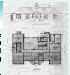
Plan of the Secretariat, Stanley, Falkland Islands drawn in 1937