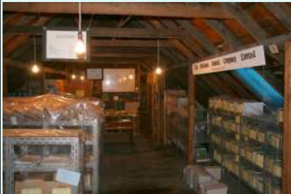
Part of the attic in the FIC Crozier Place office building

My interest in the FIC's archive material dates back about 30 years to when I was a clerk with the Company in the Crozier Place offices. Office stationery was kept in part of the attics shared by dusty old leather bound volumes of FIC history, which I found absolutely fascinating, often to the degree that I forgot what I had gone up to the attic for. Since this material, including many files and packages, dated back to the beginnings of the Company I soon realized that it was extremely valuable.