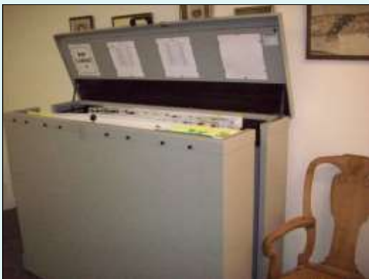
One of the map cabinets

The chance to work at the Archives has demonstrated to me the importance this building has to the Falkland Islands in preserving key information and other valuable documents. Conservation work, which I have assisted in, is therefore a vital part of Archives and has to be taken seriously and the regulations inside the building have to be enforced. On one occasion I even had to remove my own mother away from files, while she was doing Secretariat filing, after she gave herself a paper cut and was in danger of bleeding on documents. Other conservation work I have assisted in include using a special conservation vacuum cleaner to clean dust ridden documents and carefully using purified water to clean those documents which have been badly damaged before being given to the Archives.