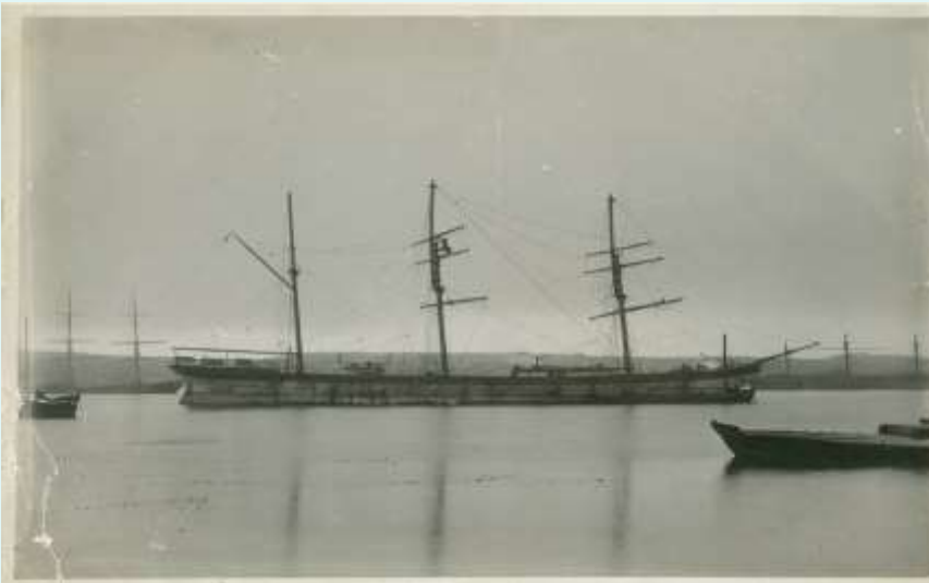
Galgorm Castle in Stanley Harbour, 1895