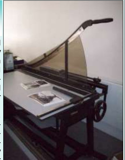
The floor standing guillotine

As my time spent at the Archives has increased so too has my responsibilities. My roles at the Archives have been varied, from the ordinary job of helping to re-organising files in the Stack to more trustworthy tasks such as helping to encapsulate historical items. However, the smaller jobs like handling some of the frequent telephone enquiries and supporting researchers has been essential to my work experience as it has improved my social skills. While helping one researcher at the Archives I had the opportunity to help collect oral accounts from a handful of local residents making me more confident when I have had to deal with complex tasks. My favourite job so far is the encapsulation of maps as it required exact precision when using the guillotine and the encapsulator in order to create the correct size pocket for each individual map. I was amazed by all the different maps of the Falklands, with some showing the divisions between land and others displaying military barracks, all conveying the transformation of the Islands throughout the years. Another job which I thoroughly enjoyed was the coding of files stored in the Stack. This massive task, despite being very time consuming, gave me a great appreciation of the care taken in databasing every single file at the Archives and this allowed me to contribute to keeping the Archives organised and specialized.