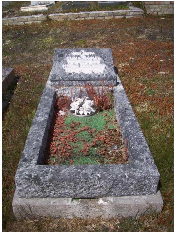
Orissa's grave in Stanley Cemetery

Orissa, age 37, died 1 February 1907 in Stanley from tuberculosis and was buried 3 February 1907 in Grave I 602. Charles, age 77 and a mariner, died 13 September 1934 in Stanley and was buried Sunday 16 September 1934 in Grave K1073. [Obituary Penguin 17 Sep 1934]