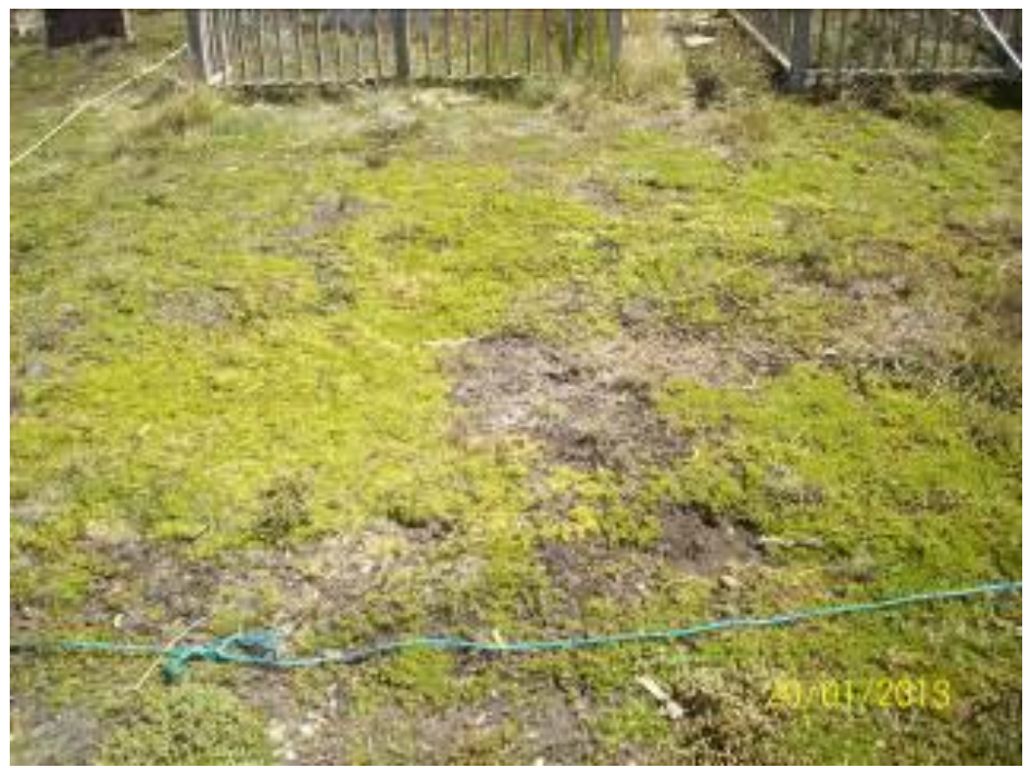
James' grave in Darwin Cemetery