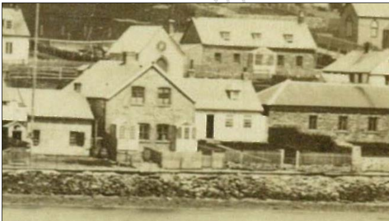
L-R Small house, Orchid House, Church House partially obscured, part of the Exchange Building 1870s

On 30 March 1871 William Alexander HILTON , carpenter of Stanley, granted to James TURNER , merchant of Stanley, 'All that parcel of land in the Falkland Islands situate in Ross Road Stanley part NE corner of Town Lot No 13 extending in depth 126 feet from North to South, from East to West 27 feet, together with the dwelling house erected thereon. The said land being bordered on the east by the Queens Arms Hotel, and on the West by the land attached to Church House' for £130. [BUG-REG-1; 399]