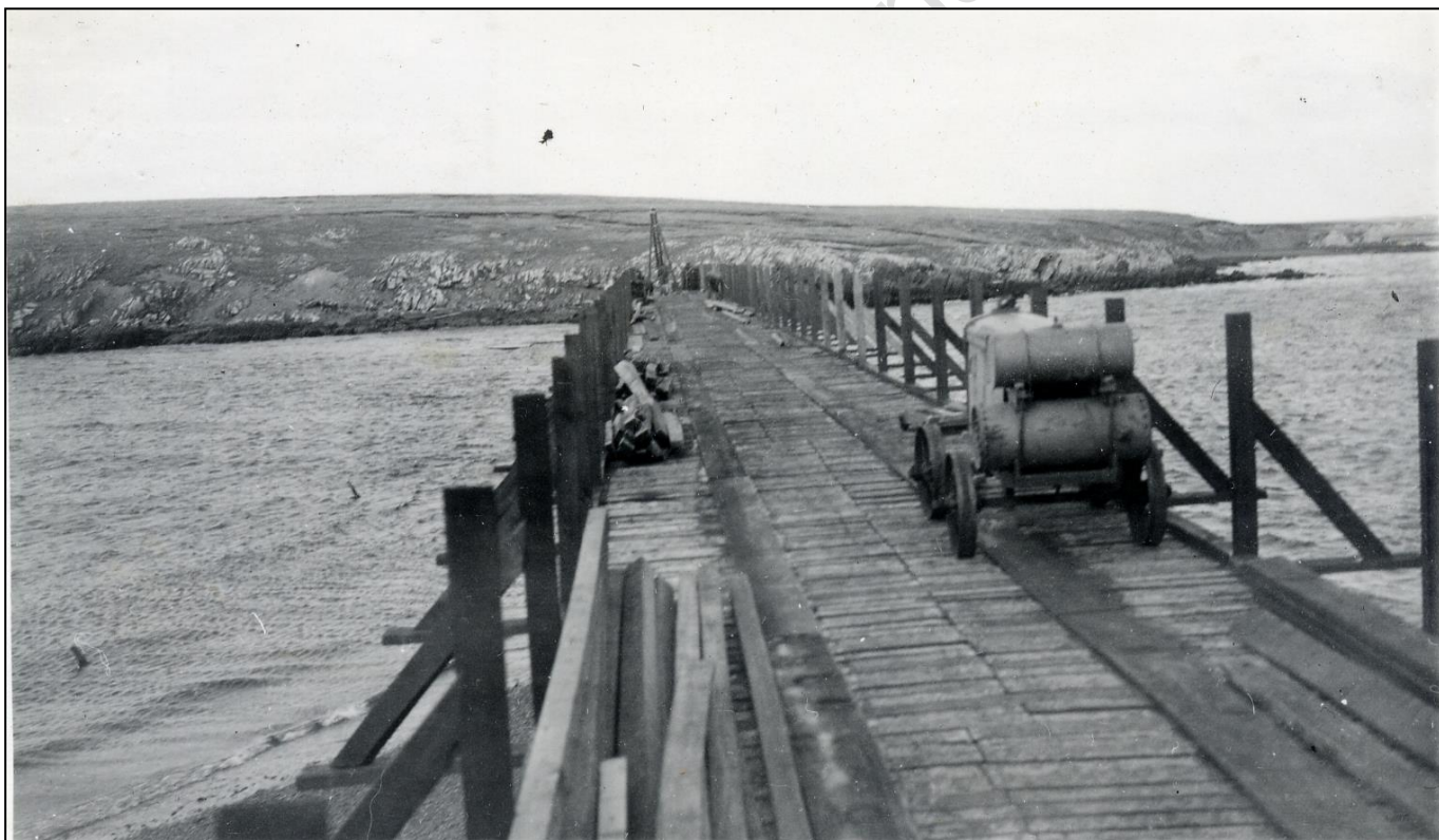
Paterson's Point Bridge under construction