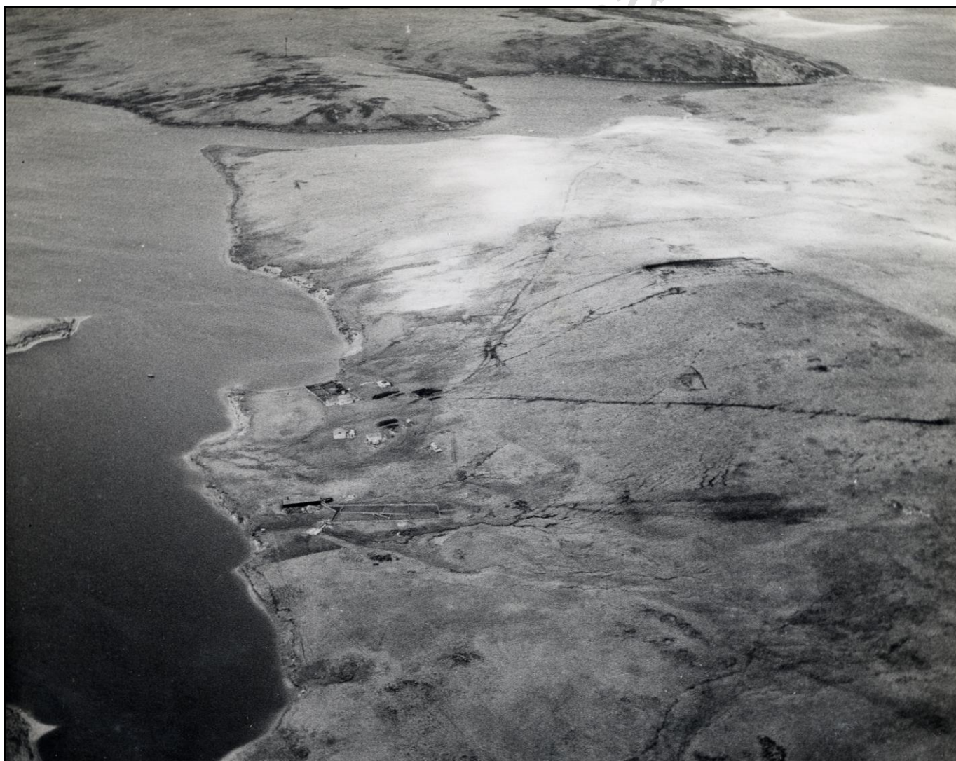
Aerial view of Bluff Cove

On 5 November 1895 the Falkland Islands Company Limited received £77 for the shepherd's house and pen on Section 35. [FIC/ZD1; 7]