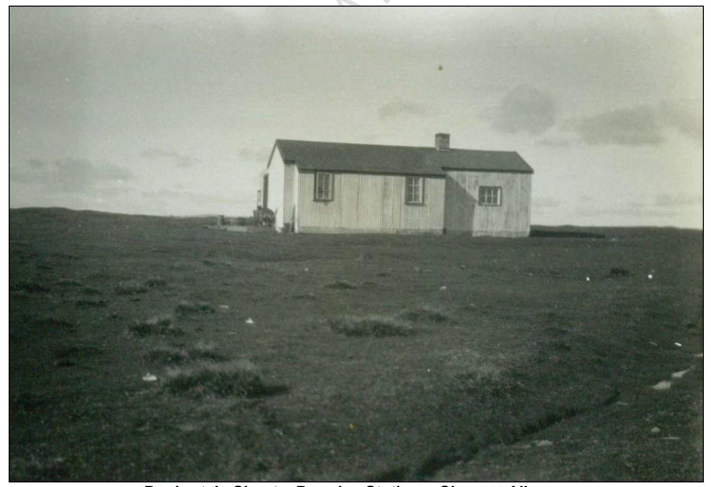
Docherty's Shanty, Douglas Station