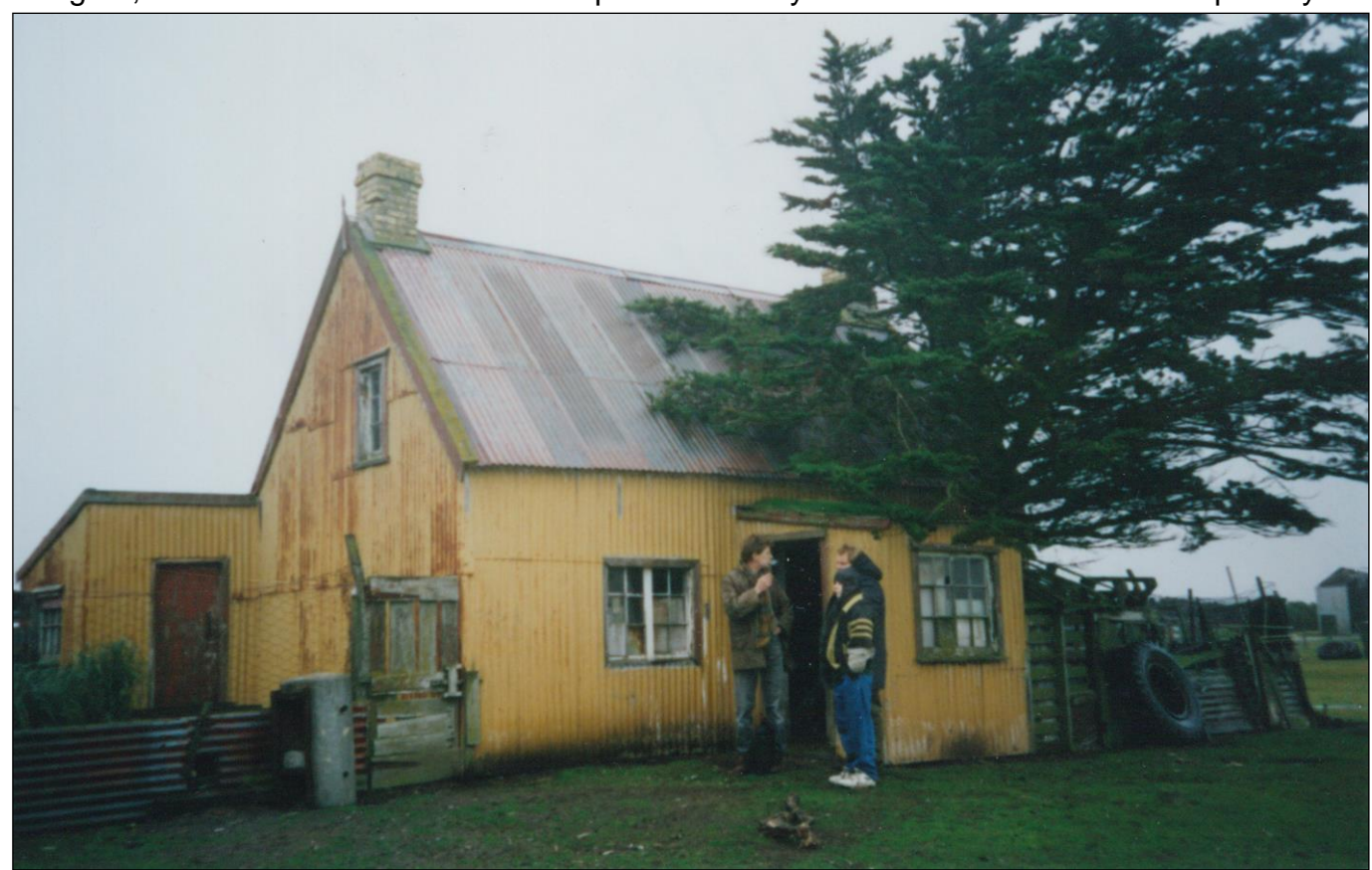
instalments. Sections 6, 13, 21, 47, 48, 70, 71, 71b. [P4; pg 158]

In 1907 George GREENSHIELDS , on behalf of himself and the other shareholders in the Estate Robert Greenshields, applied to purchase under Land Ordinance 1903 the leased lands known as Howgate Station and Wickham Heights, a total of 63,000 acres less the 1,680 acres compulsorily purchased under Crown Grants 291 and 280. The purchase price was £9,198 being 61,320 acres at 3/- with 10% to be paid 1 January 1908 and the balance to be paid by 30