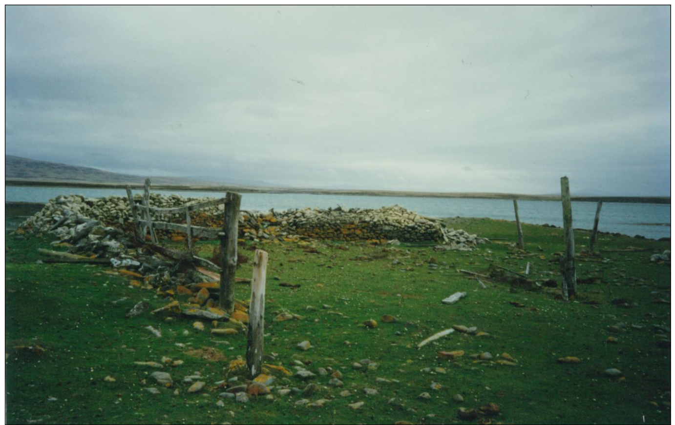
Remains of drystone corral on Long Island, 1996

In March 1843 a hut was built at Long Island. "This hut is situated on the shore of the mainland facing the ford leading to Long Island. It is built of stone and clay with a good roof, door and fireplace. It has not been inspected on the part of Government since October 1845. It was then in good repair. It was built in March 1843. The site of the hut is marked G in the chart of the Falkland Islands. The corral is a small one built of dry stones not very well. The walls are thin and low, it was in good repair in October 1845. It is situated on a point covered with shingle on the west end of Long Island marked H on the Chart. 28 September 1848." [E1; pg 161]