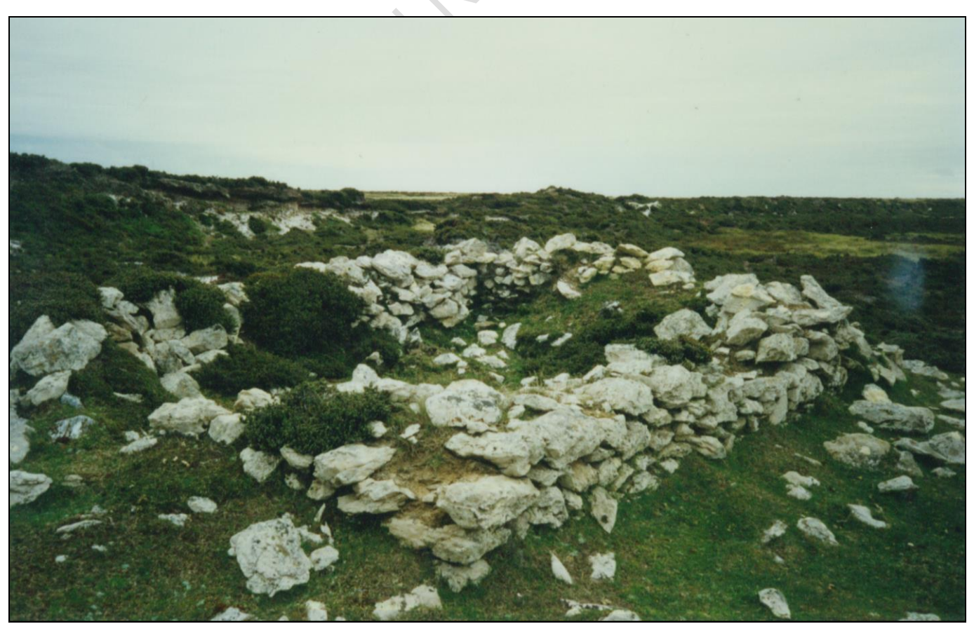
Remains of stone and clay hut on Long Island, 1996

In the 1830s a turf wall was built across Point William. "Corral and hut on Point William commonly known as the "Mangara". This corral contains about 300 acres principally tussac and is formed by a sod wall and ditch constructed across a narrow neck of land between Kidney Cove and Point William, - on the spot marked I on the Chart of the Falkland Islands. It was original built by the Naval officers in charge of the Islands before it was made a Colony but was thoroughly repaired in 1846 at a cost of 60£ to the Colonial Government. A turf hut very small was at the same time constructed outside the gate for the use of the Guacho in charge of the Government cattle. The Government cattle and horses were kept there for a year after it was repaired. 16 September 1848." [E1; pg 157]