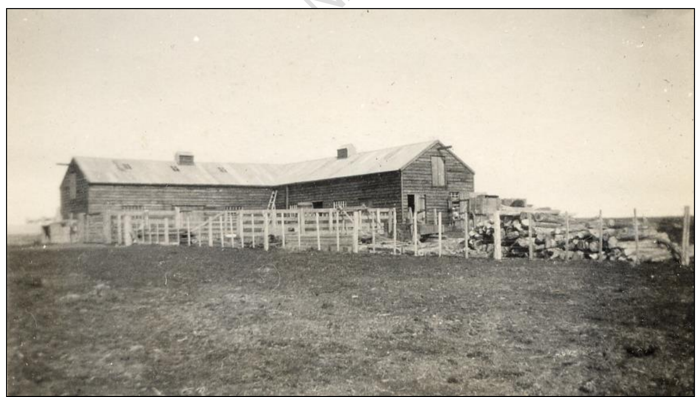
Anson stables

Foundations for the eight-roomed manager's house were started in March 1926. The approximate size of the house was 40' x 30' x 16' to eaves and back view. Built at a cost of \pounds 2,904 . [AGR/ANS/2#2]