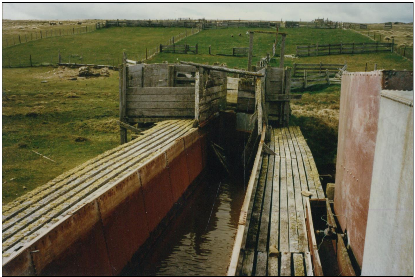
The Green Patch Dip, 1996

Mount Kent. On the South by a range of mountains of which Mount Kent forms one and by the River Murrell till it meets the suburban boundary of the SW corner of Section 57." [BUG-REG-9; pg 43]