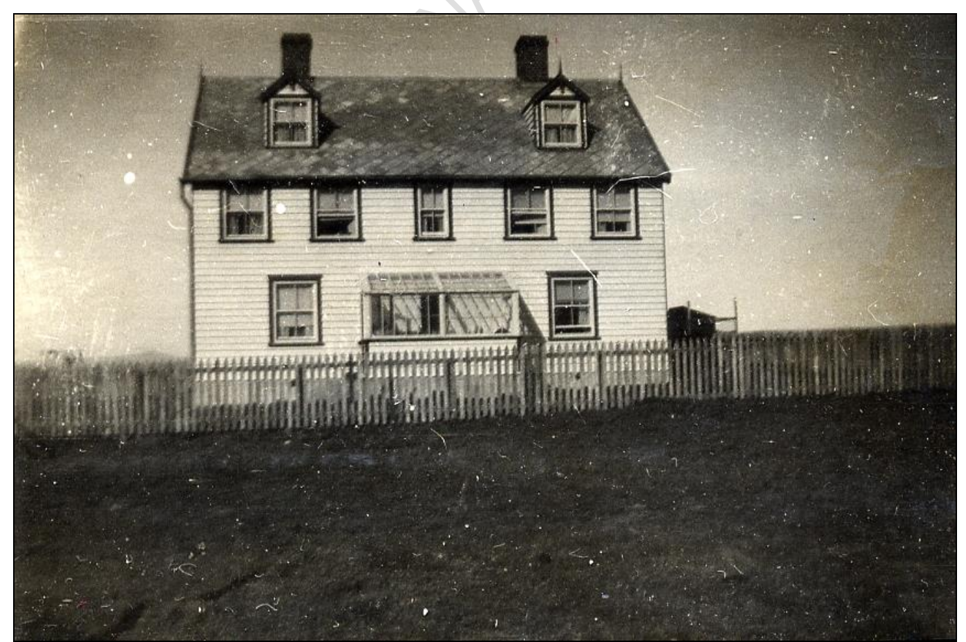
Front view of the manager's house at Anson

The five roomed farm hand's cottage at Anson, approximate size 32' x 24' x 14' to eaves, was built by Messrs GRIERSON and DETTLEFF and completed in 1926 at a cost of \pounds 1,110. [AGR/ANS/2#2]