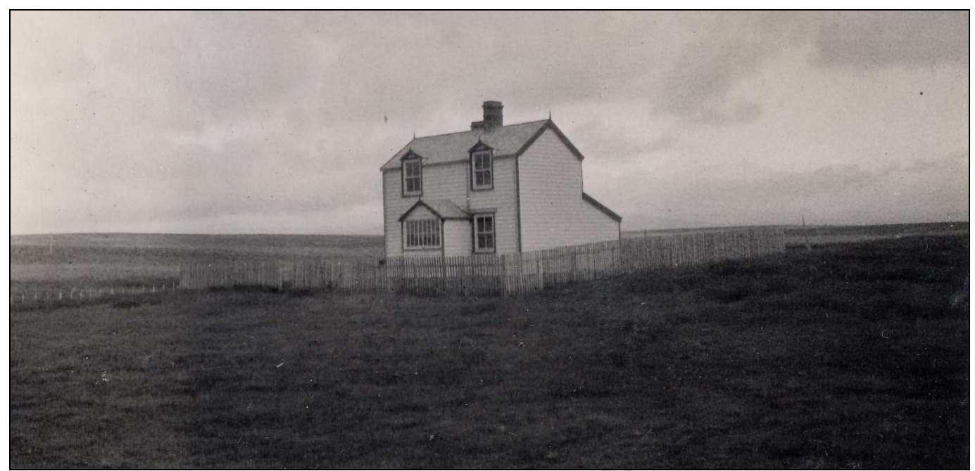
Farm hand's cottage at Anson – photo FIC Collection, JCNA

with a total acreage of 5,224 for Block 5. During 1925 £2,499 was disbursed from the Land Sales Fund to meet the initial establishment costs. £7,630 was disbursed from the Land Sales Fund during 1926 on the establishment and on stock investigation and research, £8,802 during 1927 and £1,361 in 1928. [R/AGR/SHE/1#2: Col Ann Reports; 1924-1928]