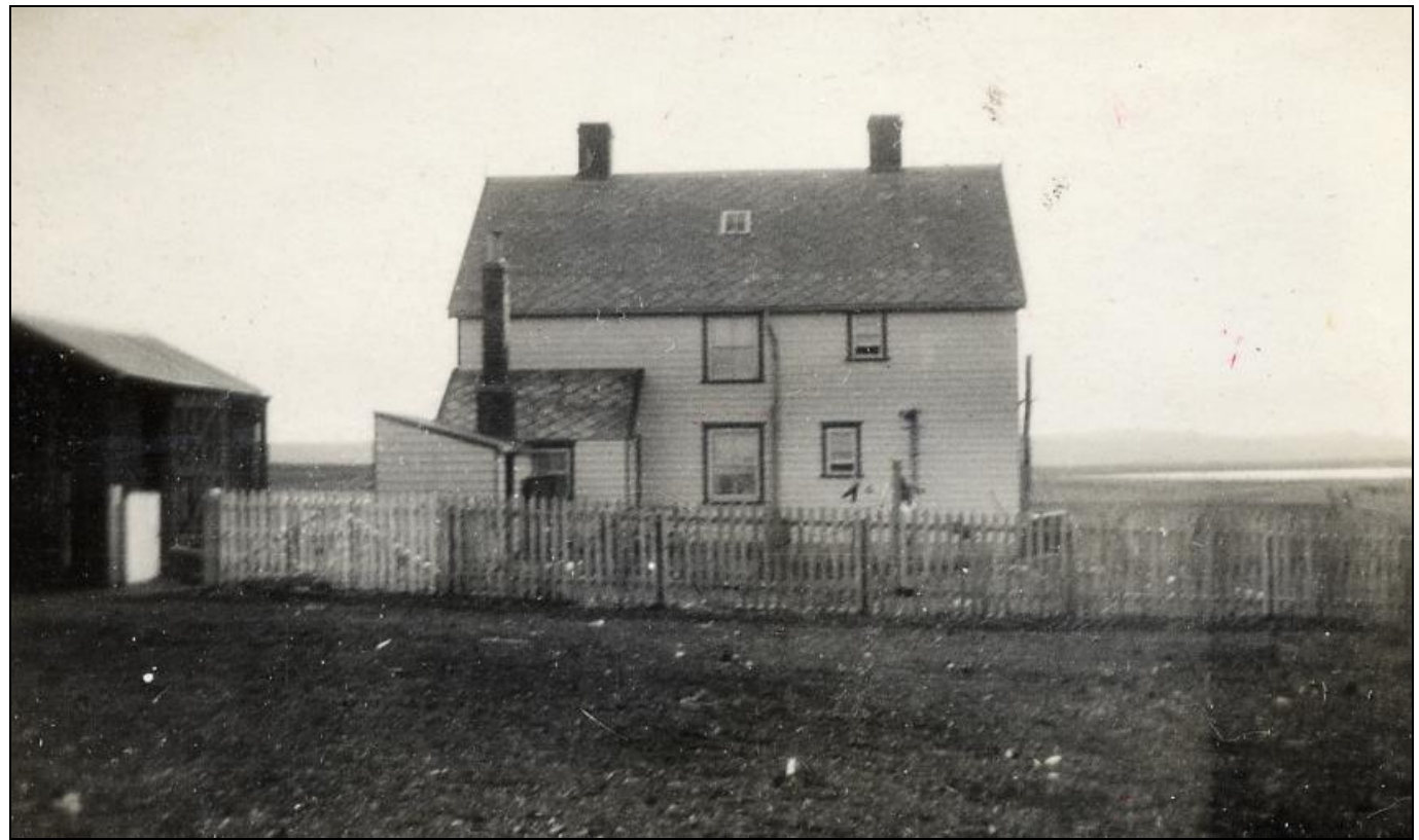
Back view of the manager's house at Anson

Foundations for the eight-roomed manager's house were started in March 1926. The approximate size of the house was 40' x 30' x 16' to eaves and back view. Built at a cost of \pounds 2,904 . [AGR/ANS/2#2]