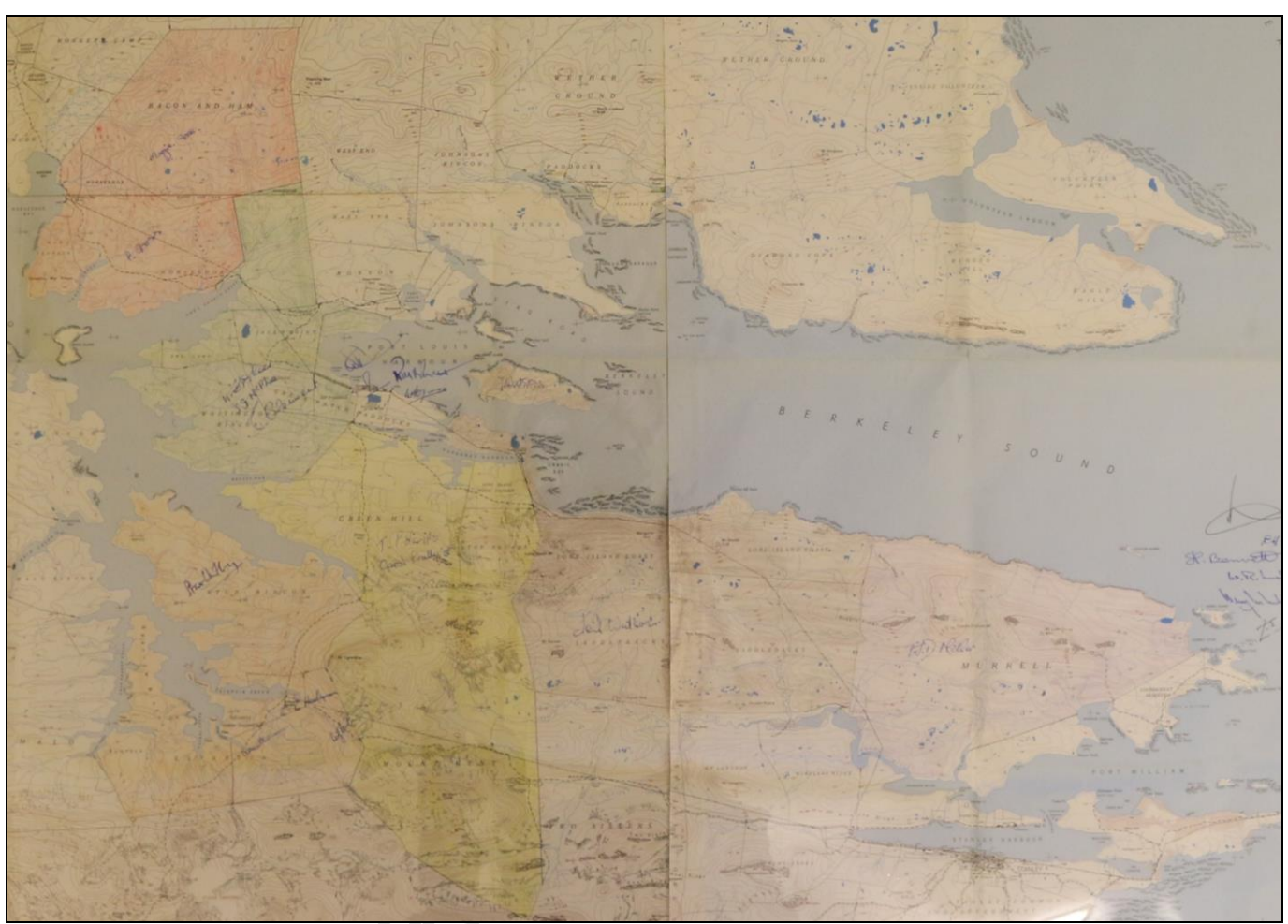
Signed sub-division map

Sub-division of Green Patch was first proposed by the Falkland Islands Co Ltd October 1977 in a broadcast notice to the public. Green Patch (originally called Port Louis South) was purchased by the Falkland Islands Government from the Falkland Islands Company Ltd for £170,000 and sub-divided into six sections and handed over to the new owners 2 April 1980. Sub-divided into: Murrell 10,650 acres; Saddlebacks 14,288 acres; Mount Kent 17,246 acres; Estancia 10,260 acres; Whitingtons Rincon 7,883 acres, Bacon & Ham 13,360 acres.