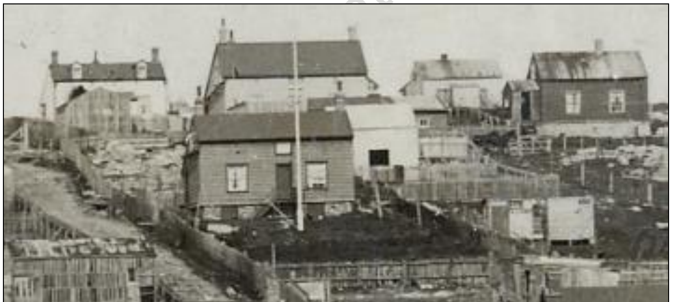
1927 - L-R back: 7 Dean Street, 28 Davis Street, 1 Callaghan Road and 26 Davis Street

In 1891, for tax purposes, the house on 26 Flagstaff Row (Davis Street) was valued at £18. There was no property listed on 7 Dean Street, 24 Davis Street and 28 Davis Street. [FI Gazette]