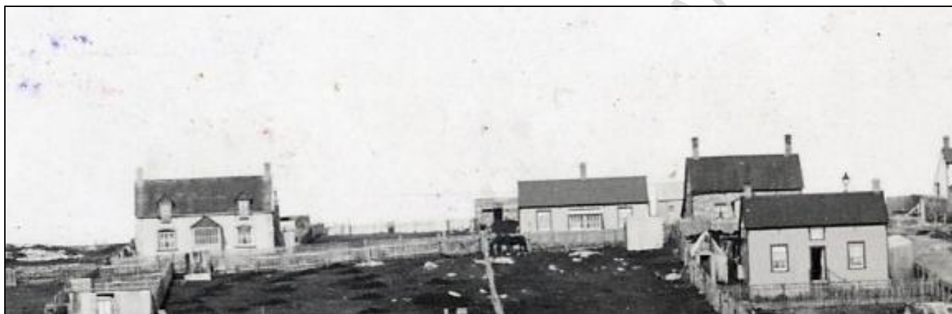
1927 - L-R: 36 Davis Street, 34 Davis Street (gap), 32 Davis Street and 30 Davis Street (partially obscured)