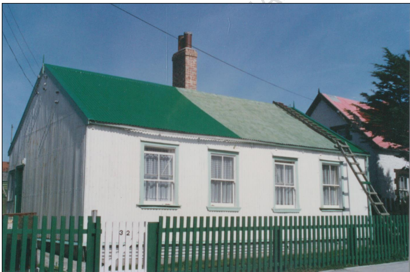
32 Davis Street from the north-east 2019