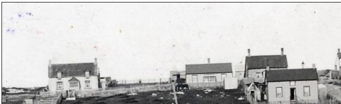
1927 - L-R: 36 Davis Street, 34 Davis Street (gap), 32 Davis Street and 30 Davis Street (partially obscured)