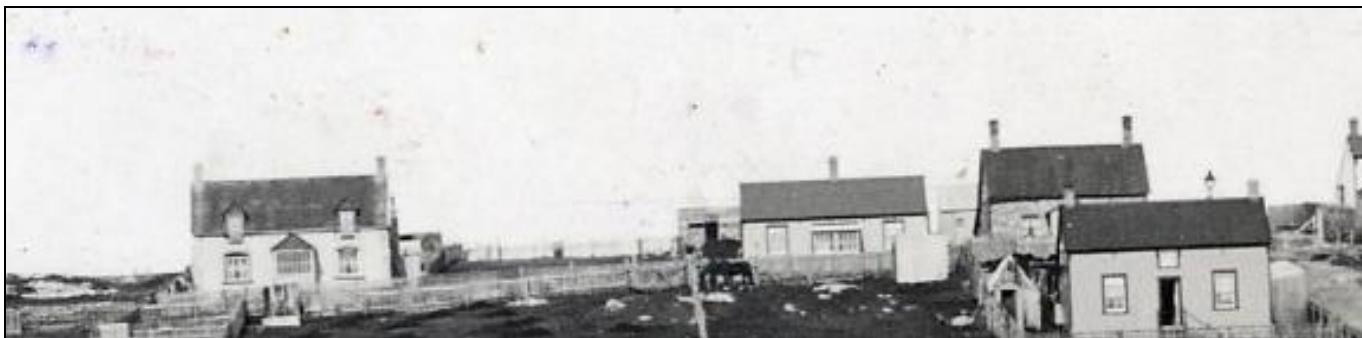
1927 - L-R: 36 Davis Street, 34 Davis Street (gap), 32 Davis Street and 30 Davis Street (partially obscured)