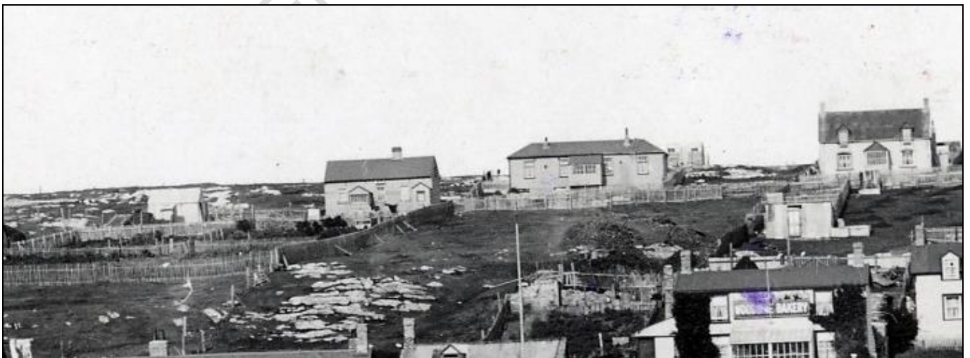
1927 - Back L-R: 37 Davis Street, 38 Davis Street and 36 Davis Street (Pill House)