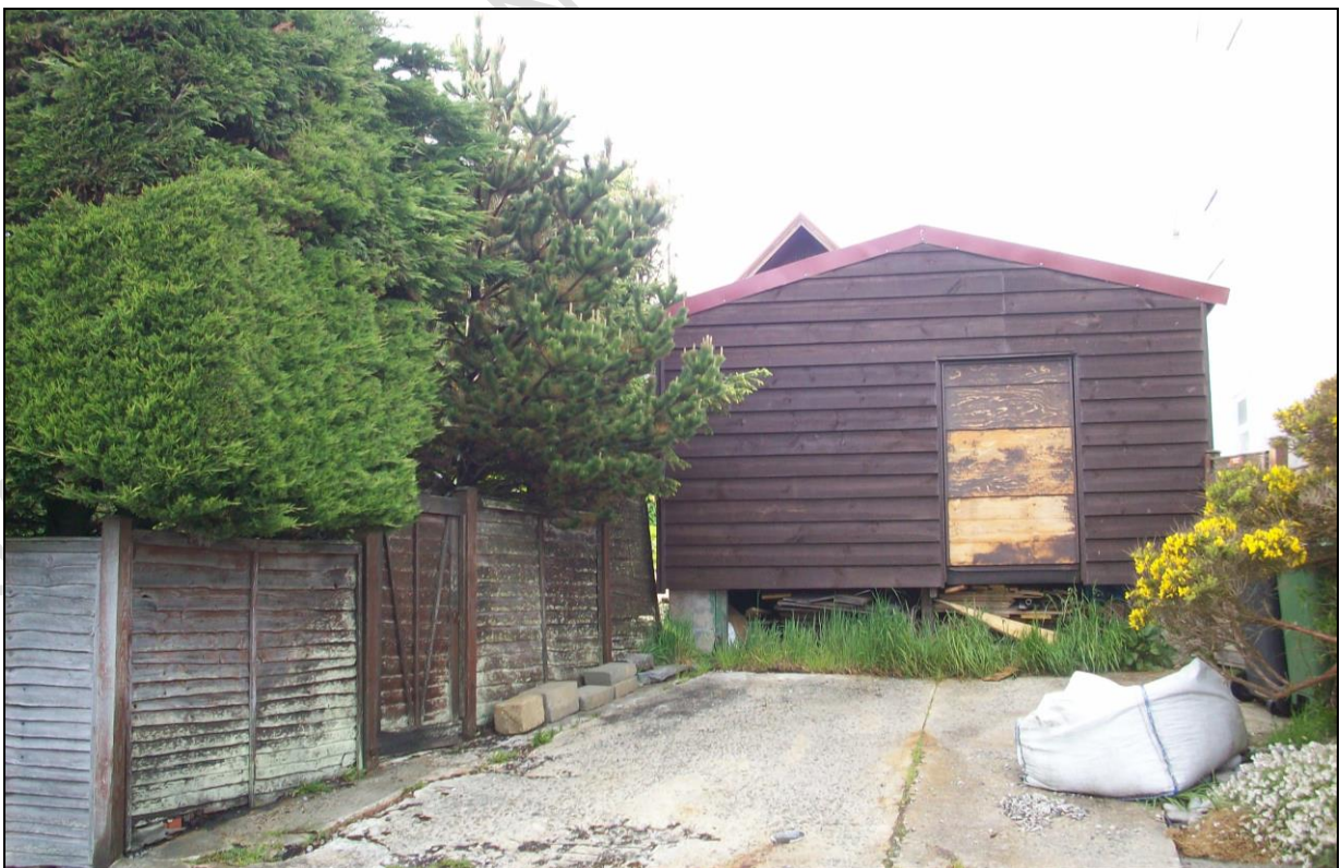
View from Davis Street December 2020 - JCNA

On 9 June 1990 an application by D B KING to build a two storey house on the plot was approved.