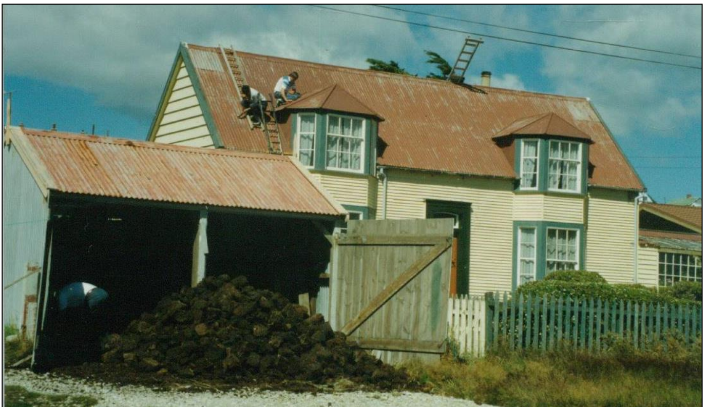
4 Ross Road East from the north east - JCNA