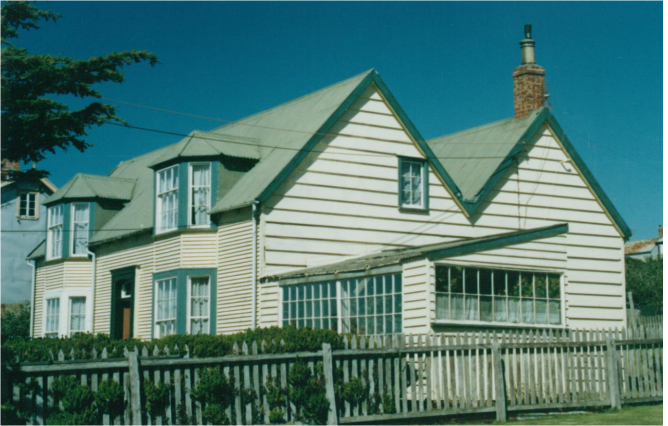
4 Ross Road East from the north west, 1994

Madge, age 93, died 8 September 1995. Rene, age 93, died 31 July 2002. The house was left to St Mary's Church.