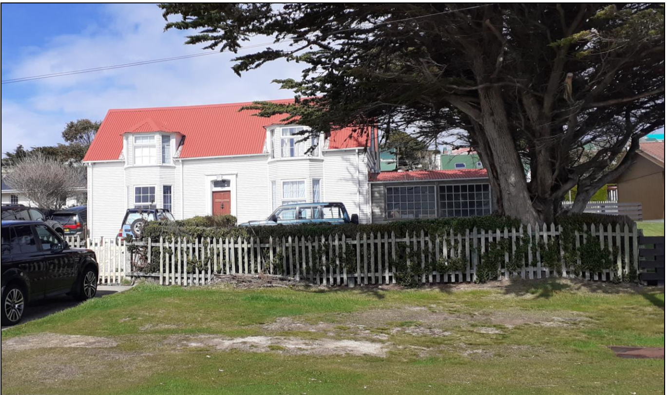
4 Ross Road East from the north, 2021 - JCNA

In 2005 the house underwent renovation work including the insertion of UVPC windows.