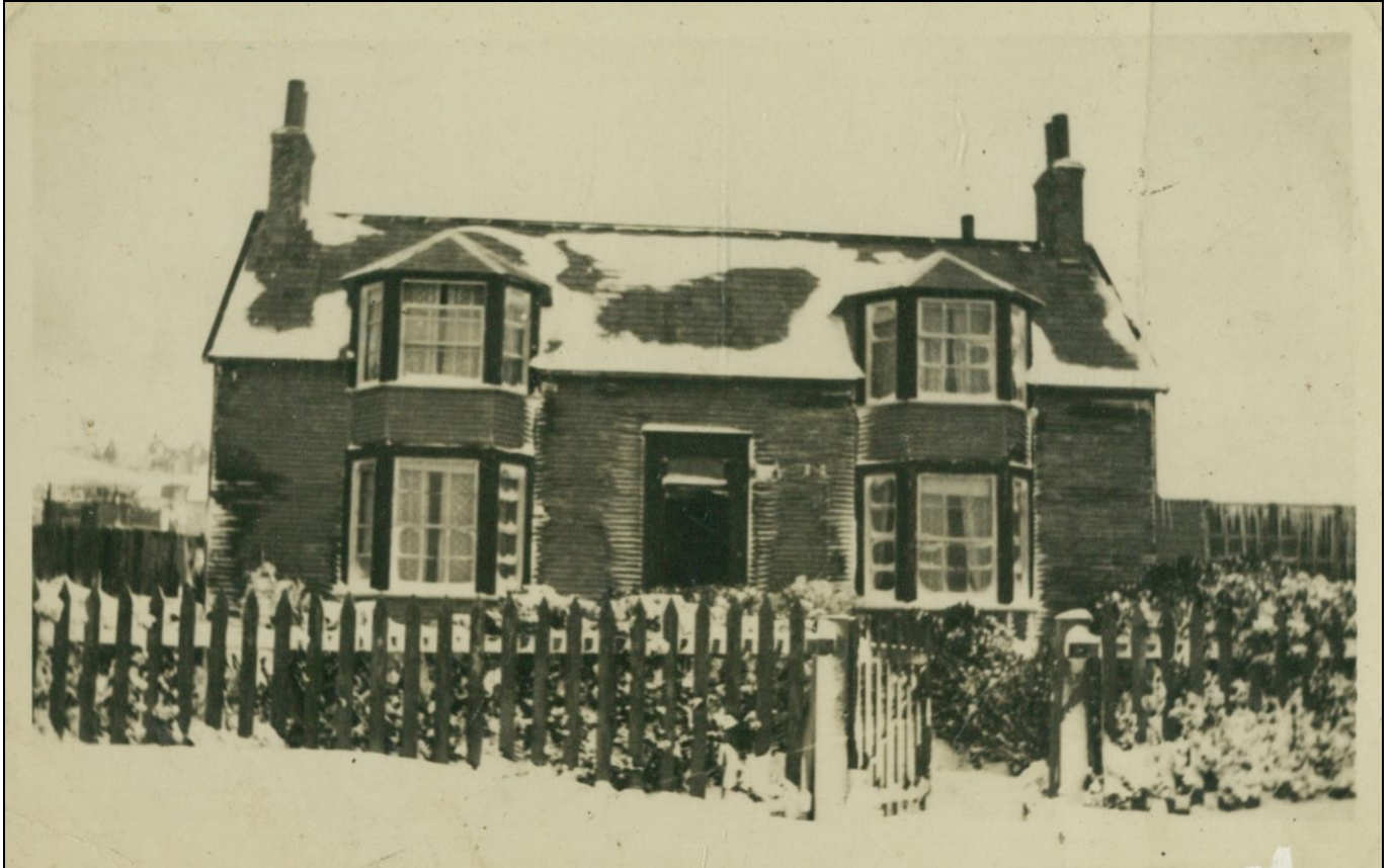
4 Ross Road East from the north

In 1944, 4 Ross Road East consisted of a house, had a rateable value of £42 and was occupied by the owner, Mrs V A H BIGGS . [BUS/RAT/2#1]