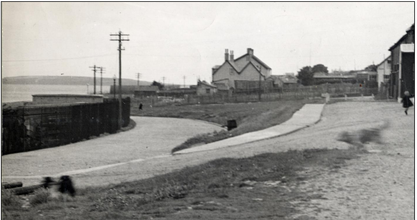
Post January 1946, the side of the house with its distinctive dual pitched roof with Viking House in the background

Mary, age 73, died 7 October 1945. Her husband, age 79, died 20 September 1949. The house passed to their two unmarried daughters, Madge and Irene 'Rene' BIGGS .