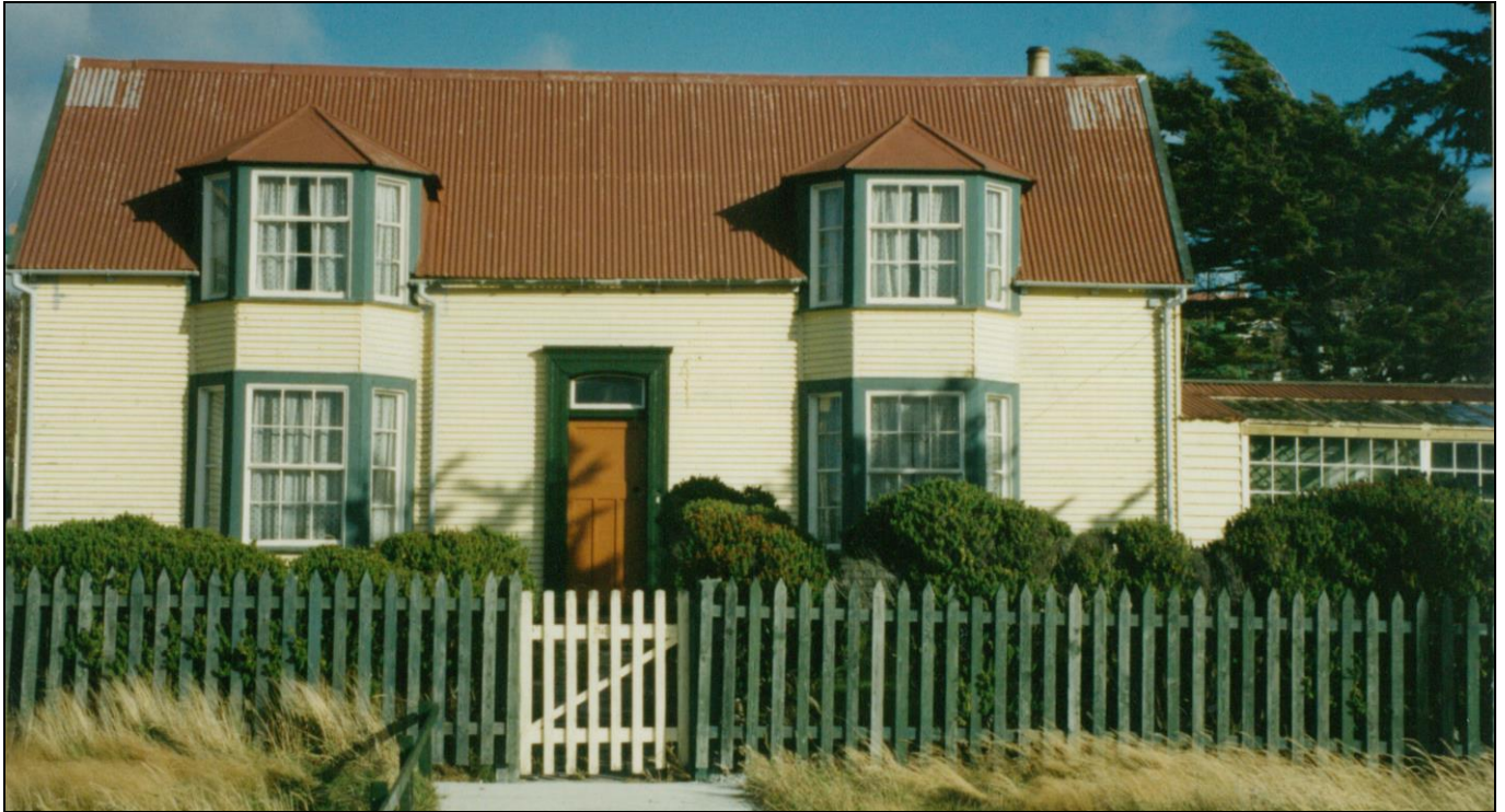
4 Ross Road East from the north - JCNA

The two main chimneys were demolished circa the 1980s.