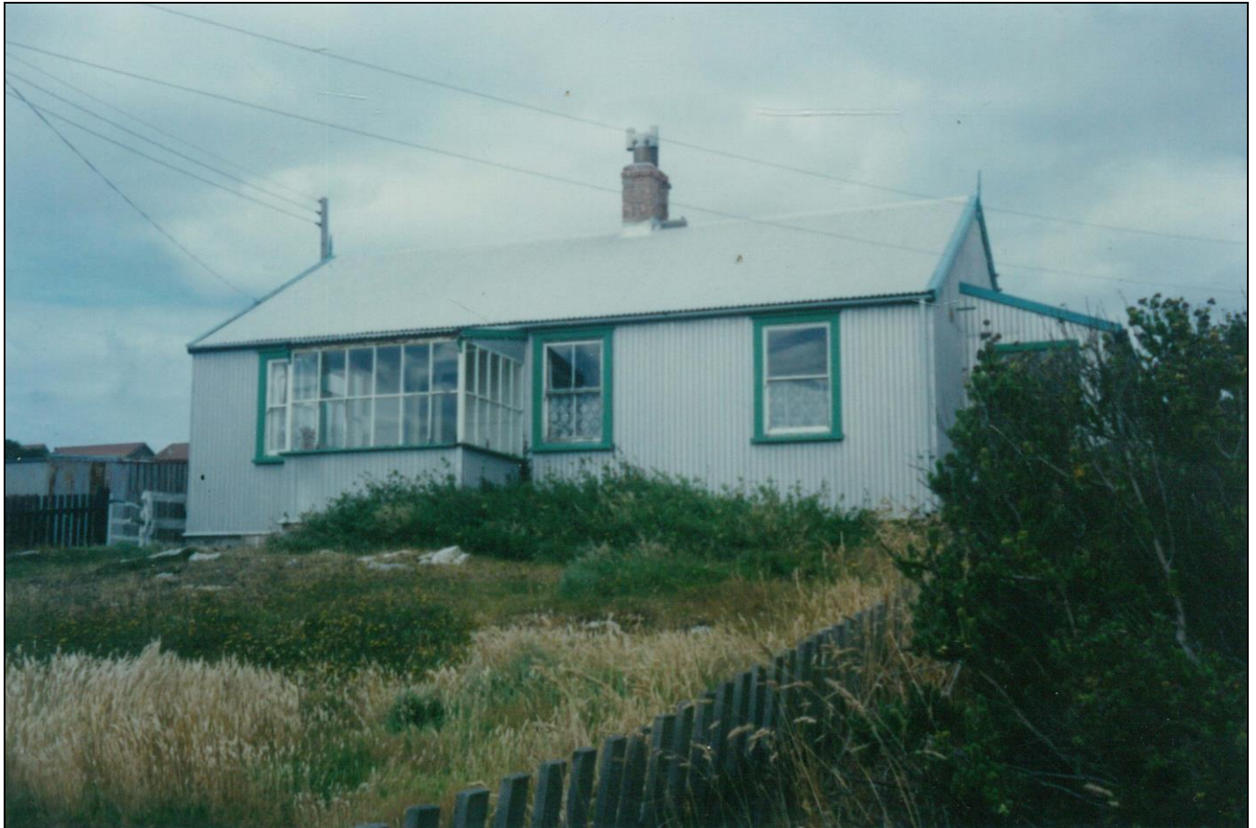
52 Davis Street 1994 - JCNA