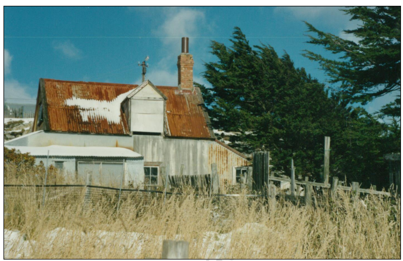
18 James Street from the north east