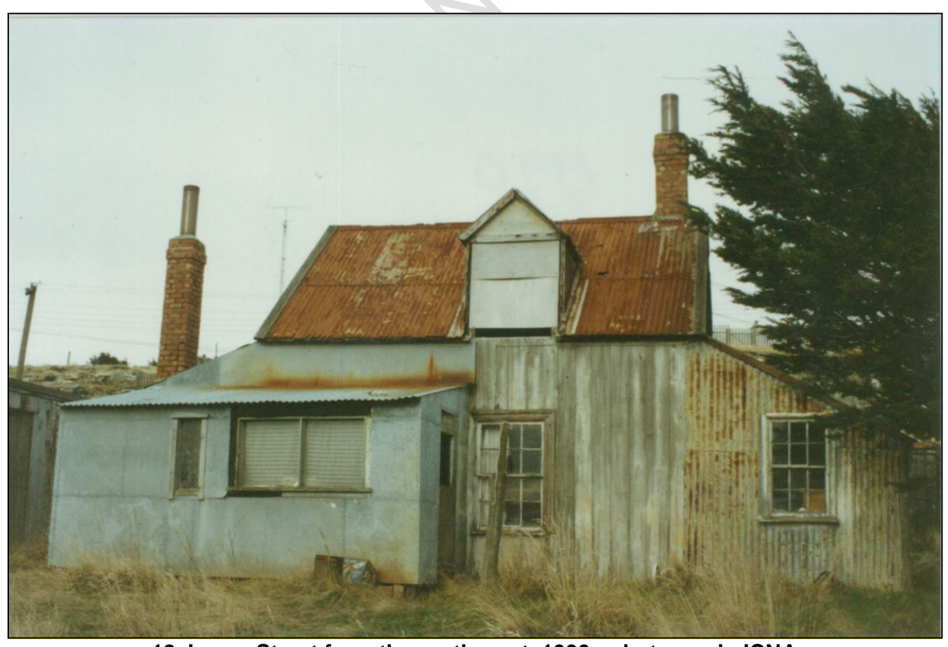
18 James Street from the north west, 1990