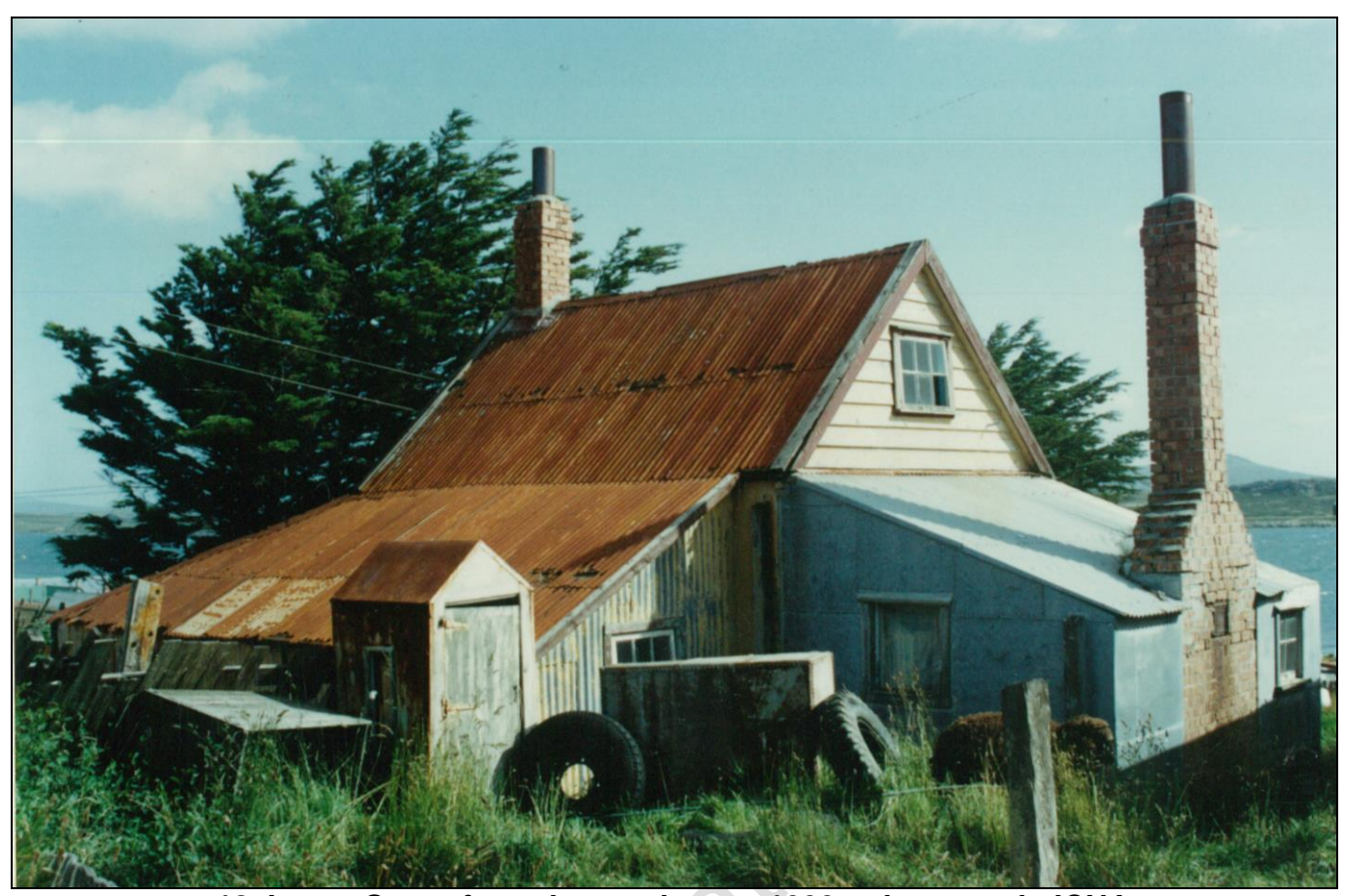
18 James Street from the south east, 1993