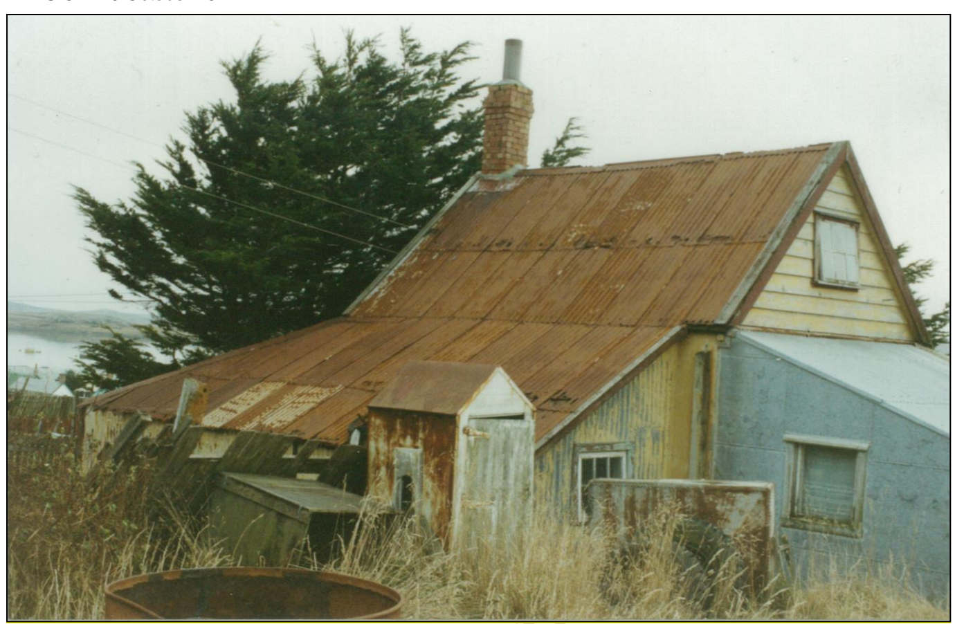
18 James Street from the south east, 1990