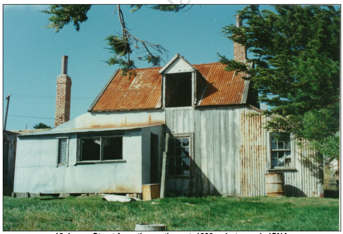
18 James Street from the north west, 1993 - photograph JCNA