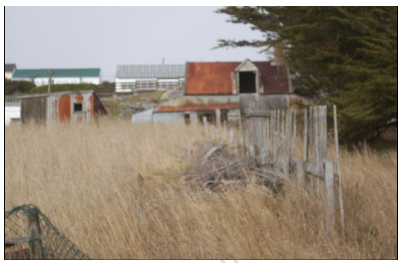
18 James Street from the north, 2019