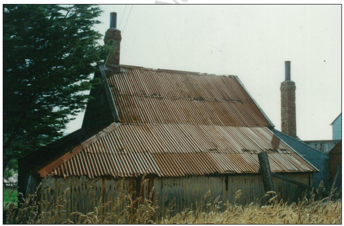
18 James Street from the south, 1993