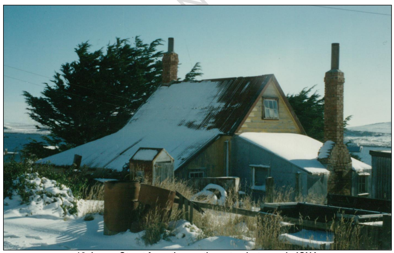
18 James Street from the south east