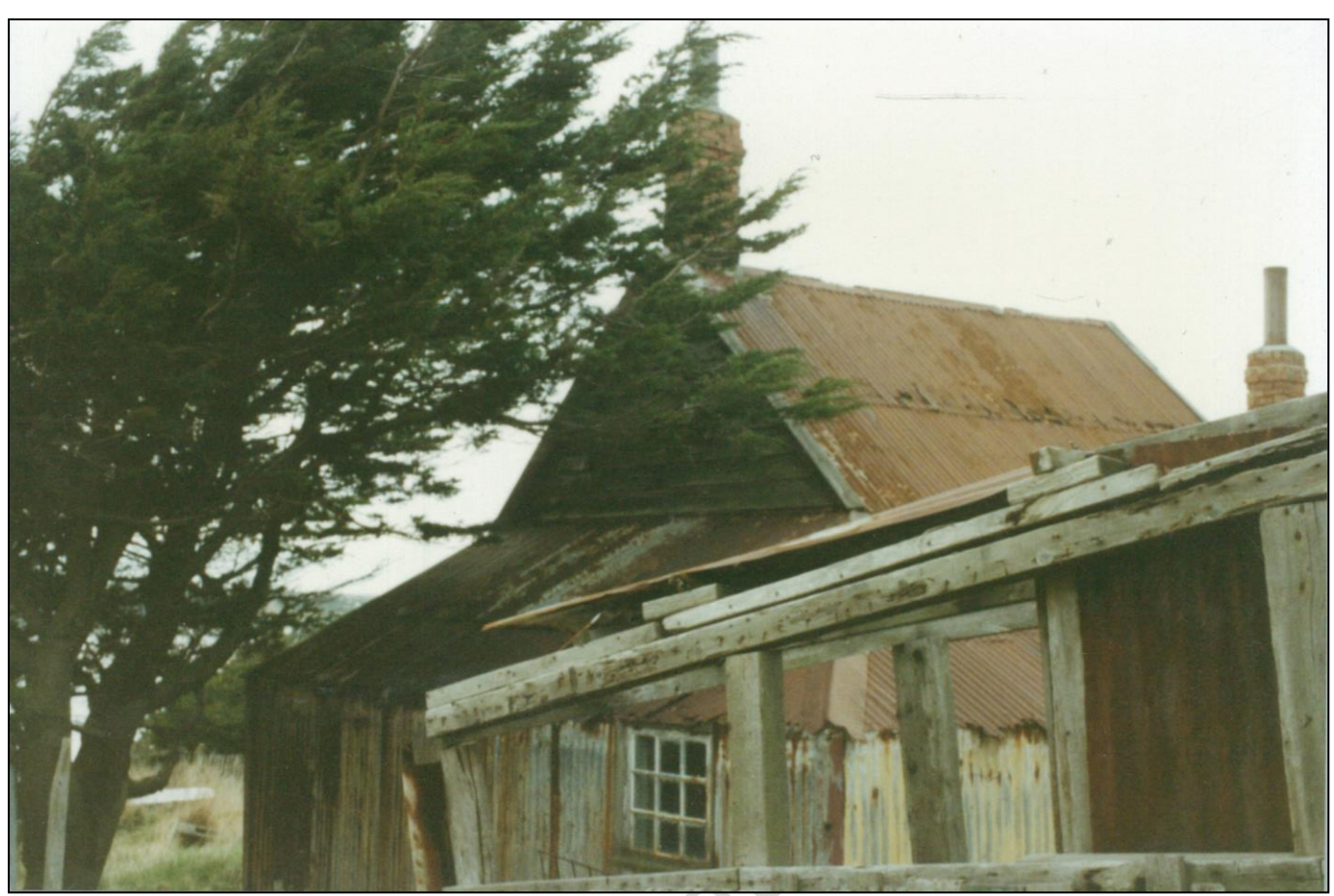
18 James Street from the south west