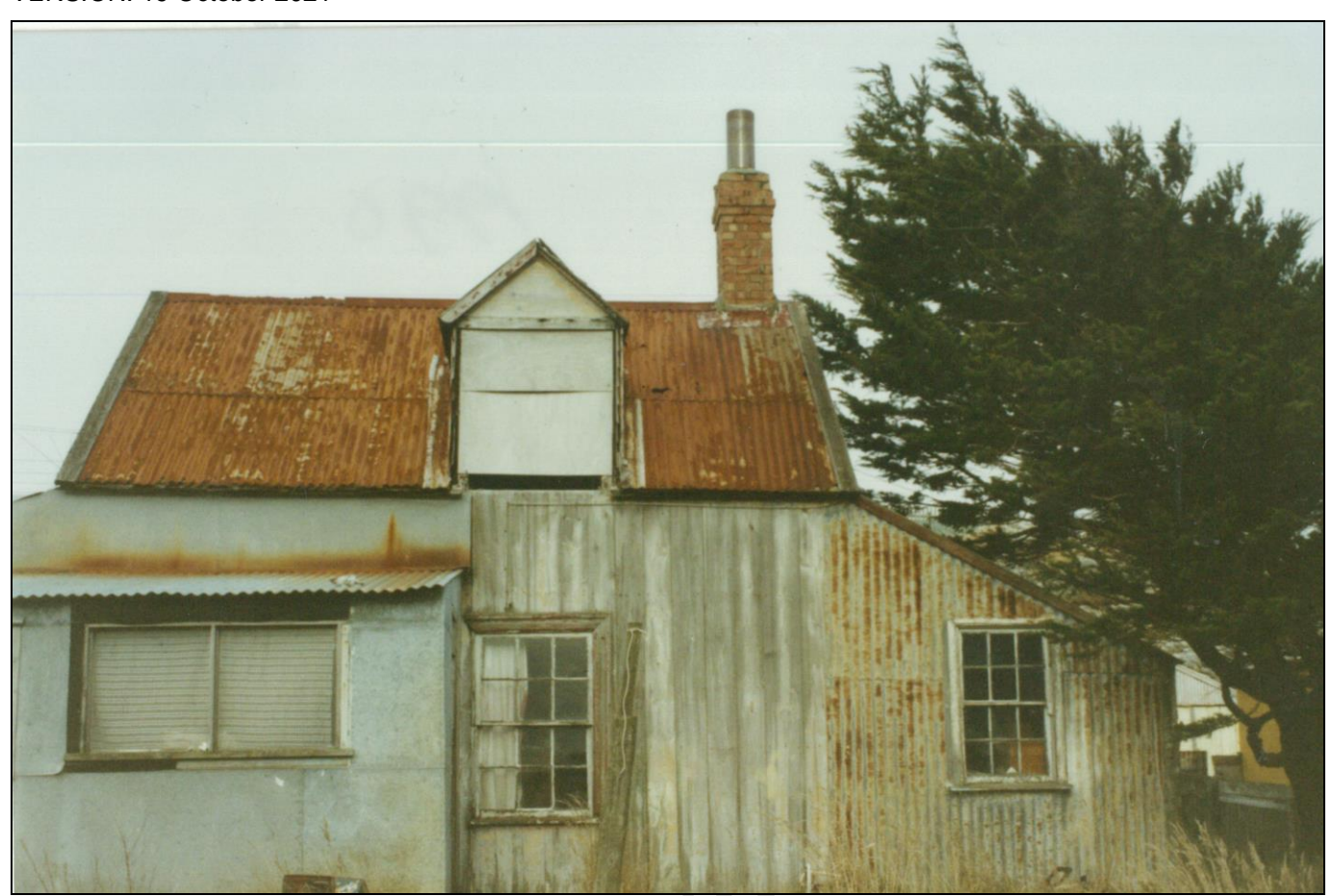
18 James Street from the north, 1990