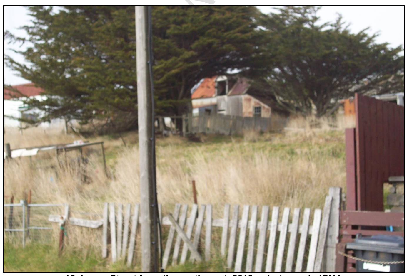
18 James Street from the north west, 2019