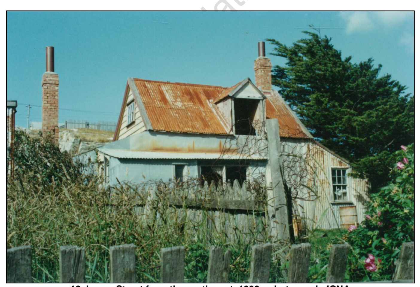
18 James Street from the north east, 1993