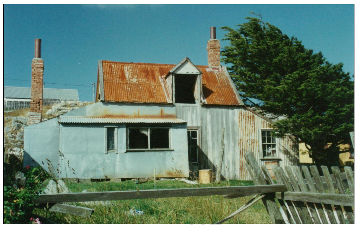
18 James Street from the north, 1993