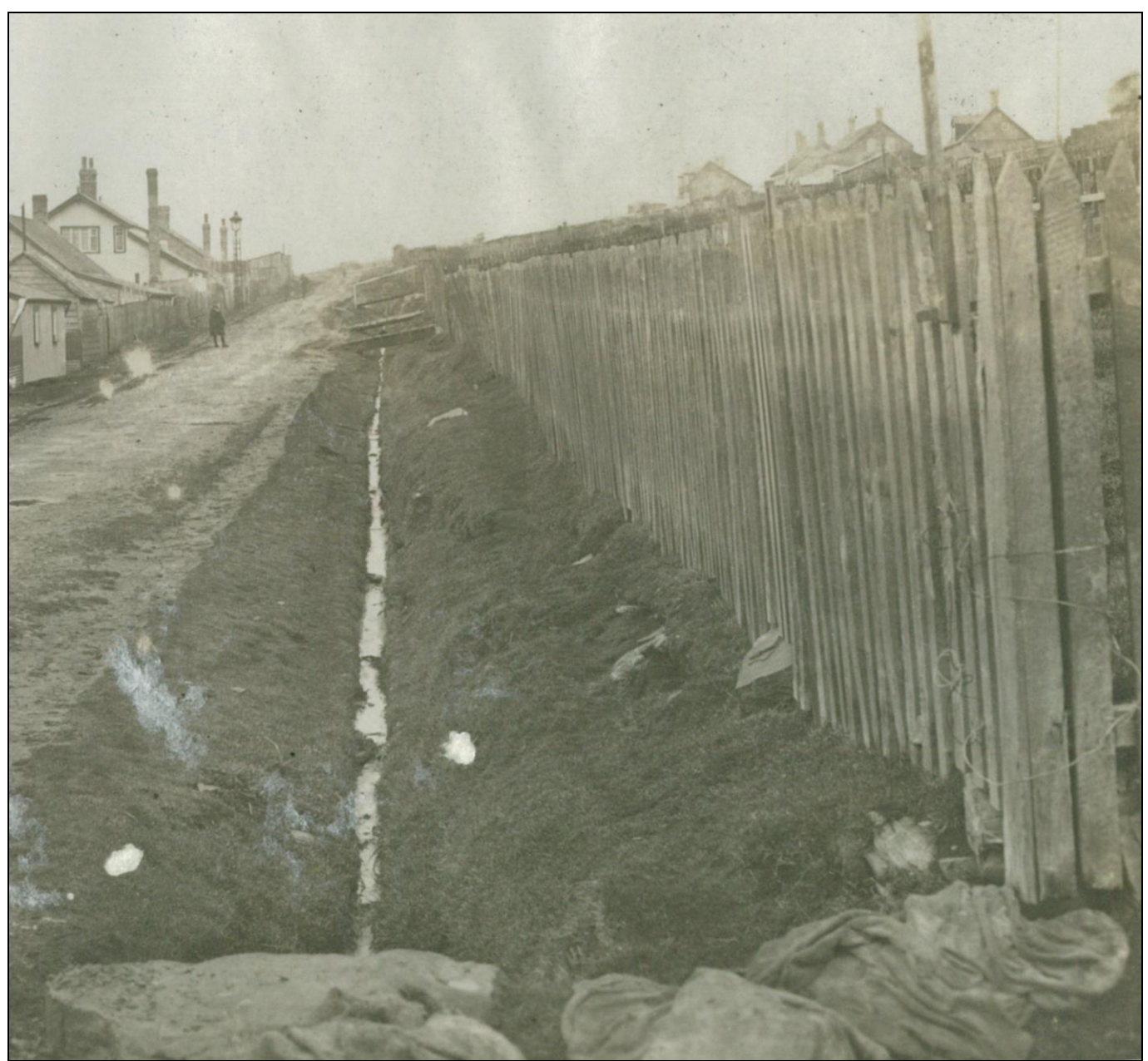
The south side of James Street, 15 June 1925. The main access to 18 James St would have been from Fitzroy Road East

In 1934, 18 James Street consisted of a house, had a rateable value of £24, and was owned and occupied by Mrs E BERTNSEN . [BUS/RAT/1#16]