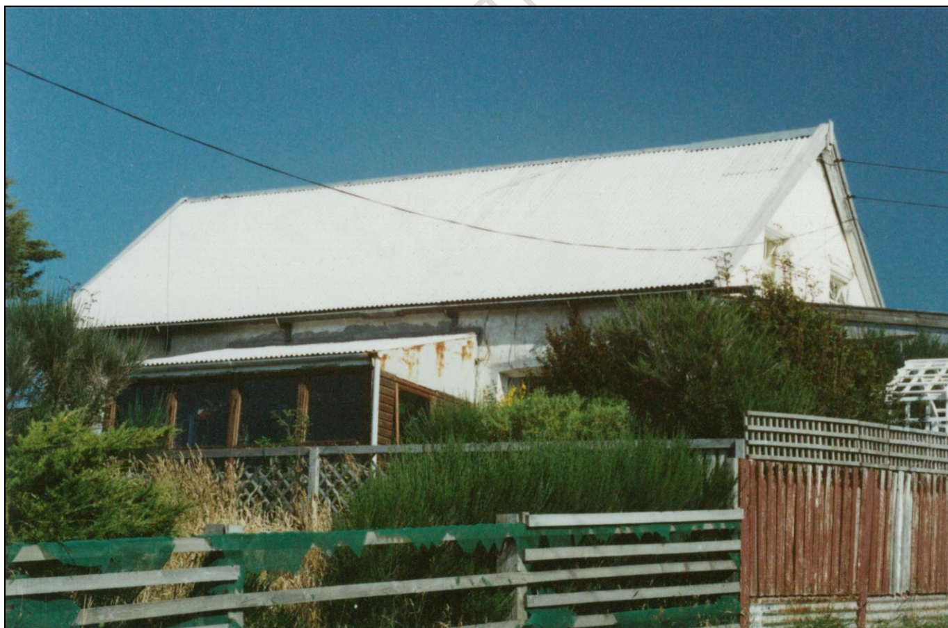
3 Hebe Street, 1993