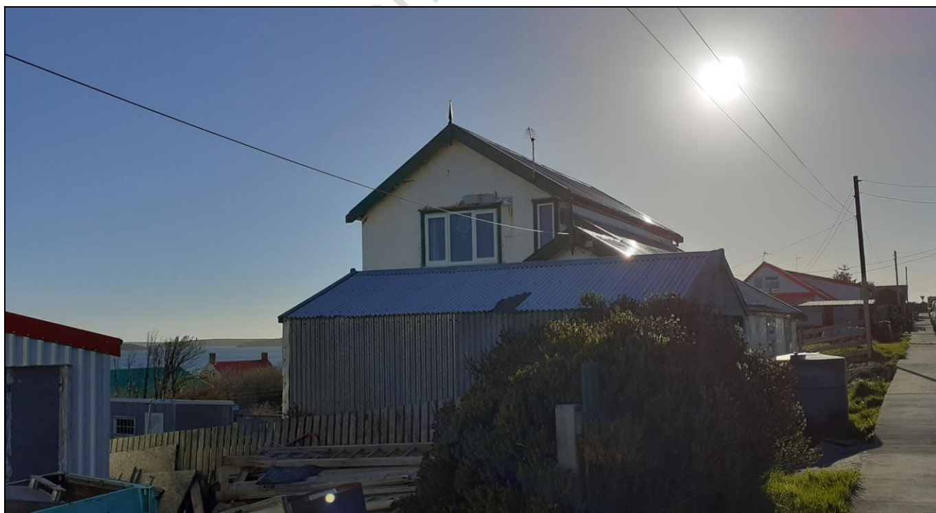
9 James Street from the West, 2021