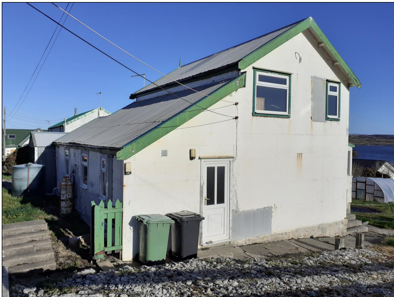
9 James Street from the East, 2021