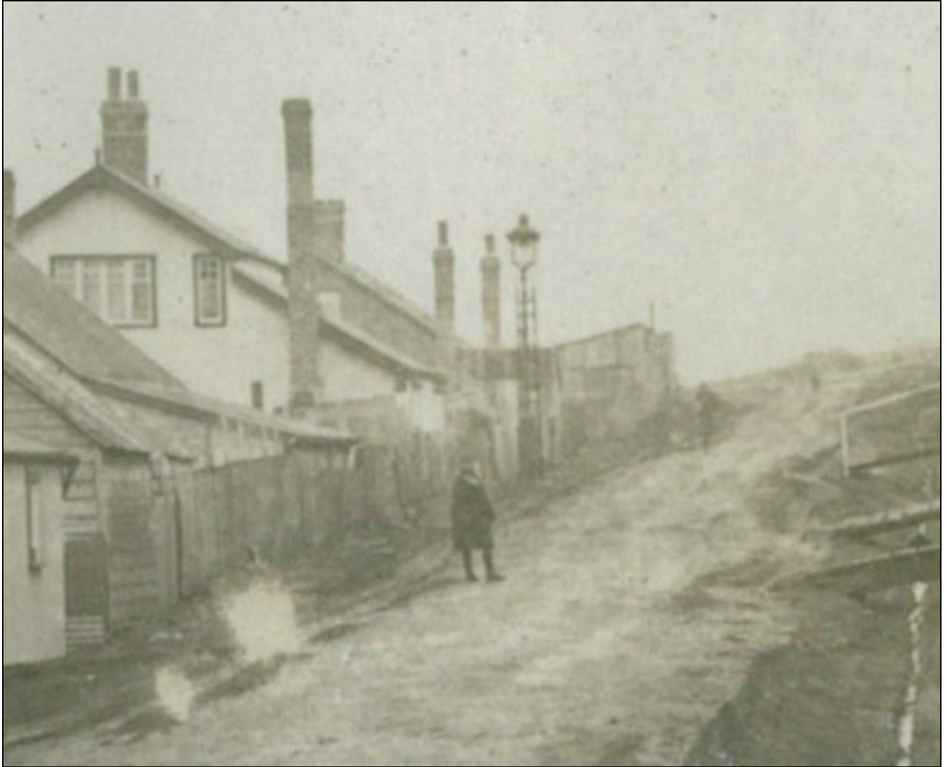
9 James Street from the south west (first house, partially obscured by No 7), 15 June 1925