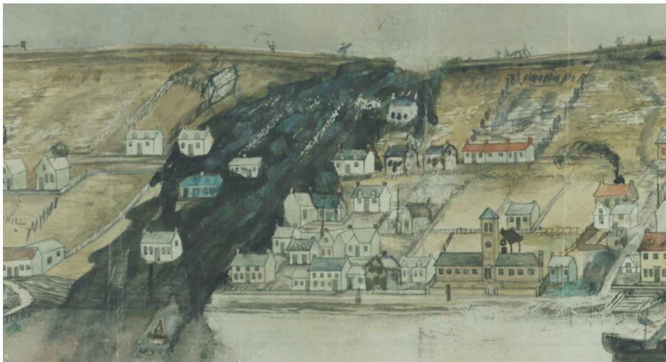
12 December 1878 - FIC Collection, JCNA