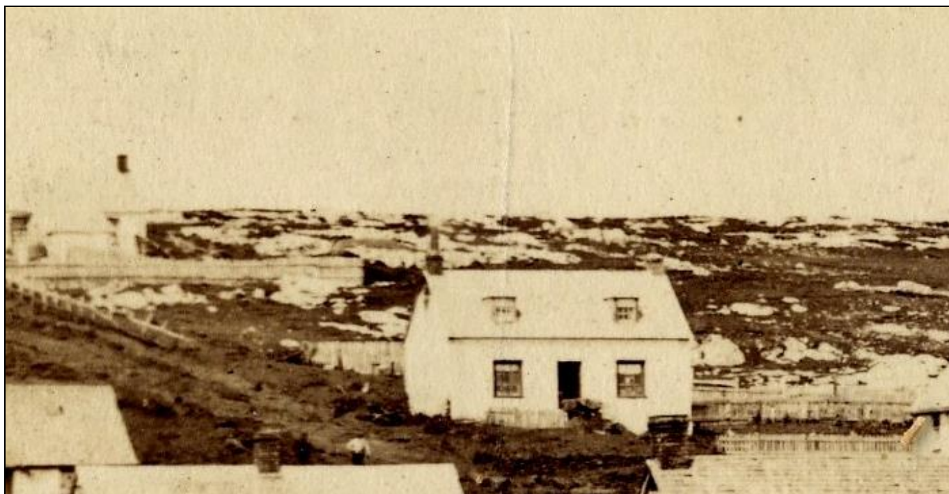
Dec 1878 after the peat slip

On 10 July 1883 John CASEY , stone mason of Stanley, granted to his brother-in-law, Edward NILSSON , mariner of Stanley, the northern portion of Lot 1 Suburban Section 1 containing one rood 38 perches and bounded " on the North by the Fitzroy Road 139 ½ links on the East by a Government Road 354 links on the South by a passage 12 feet wide 139 ½ links on the West by Lot No 2 of the same Sect 354 links. Together with the dwelling house and all other erections thereon " for £300. [BUG-REG-3; 178] - 5 Philomel Street