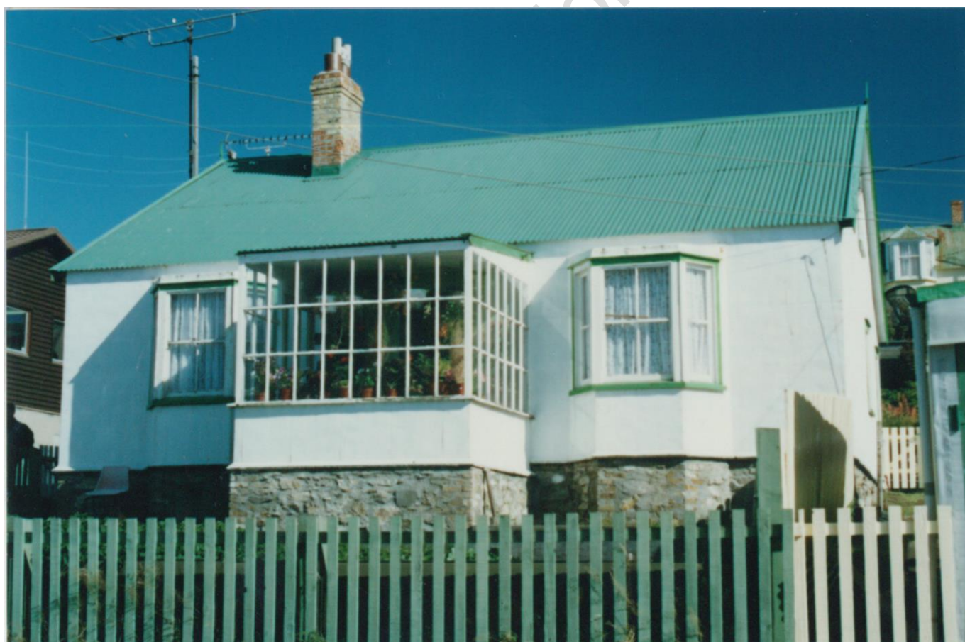
5 Philomel Street, 1994 - JCNA