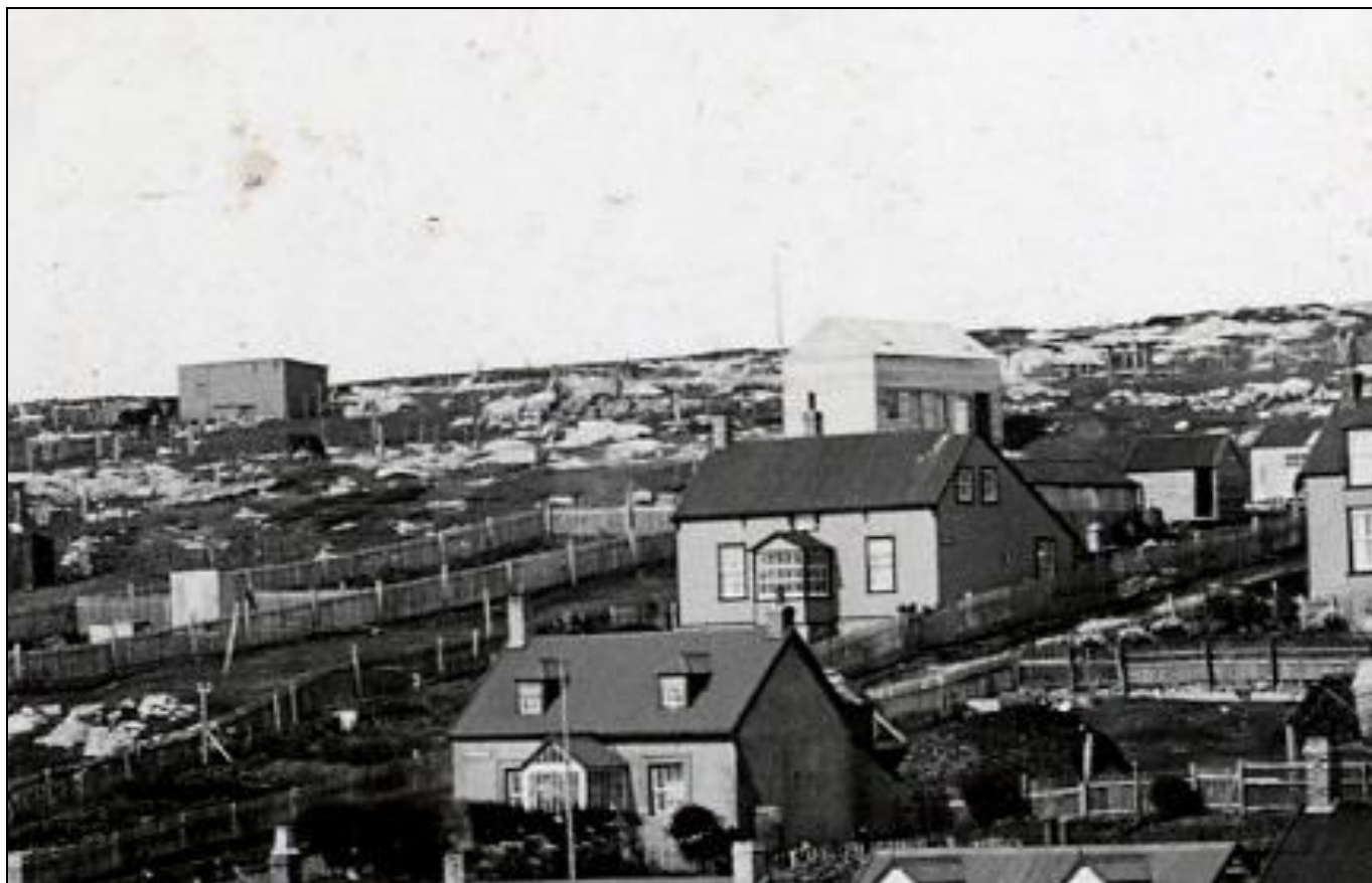
Centre front, 1927