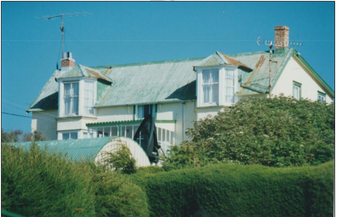
From the north west, 1994 - JCNA