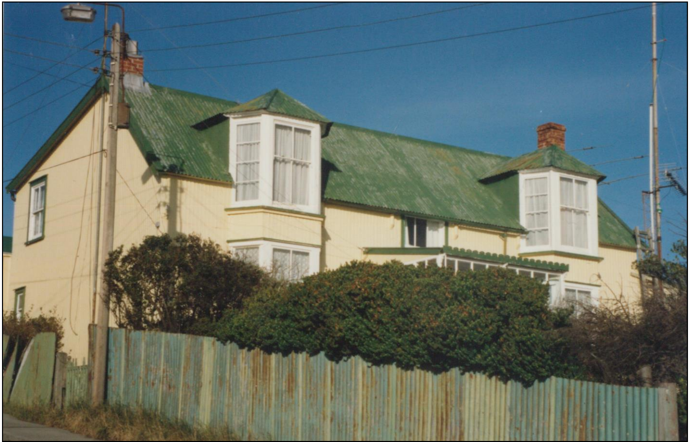
From the north east - JCNA