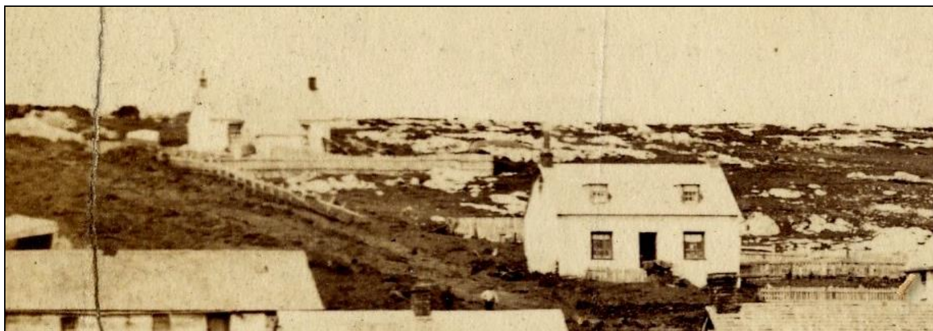
Dec 1878 after the peat slip, top 9 Philomel Street, front 5 Philomel Street

In 1891, for tax purposes, the Primrose Villa was valued at £30. [FI Gazette]