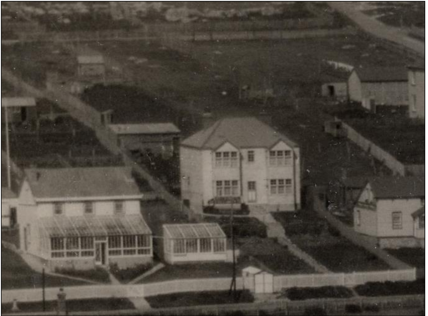
Centre 7 Fitzroy Road 1936 - FIC Collection, JCNA