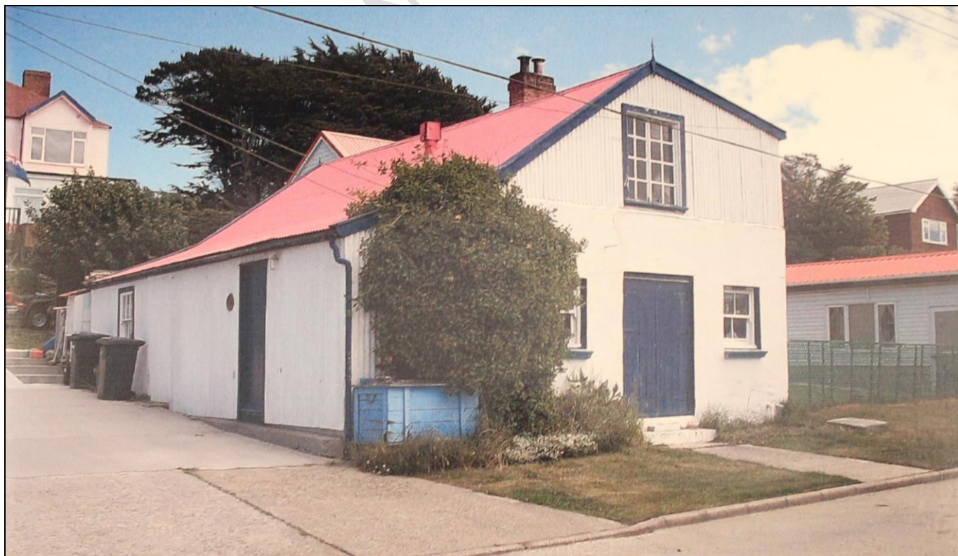
The Old Bakery with 7 Fitzroy Road just visible on the left 2016