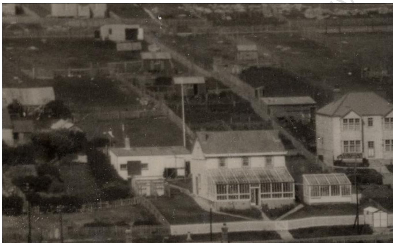
9 Fitzroy Road (centre), 1936