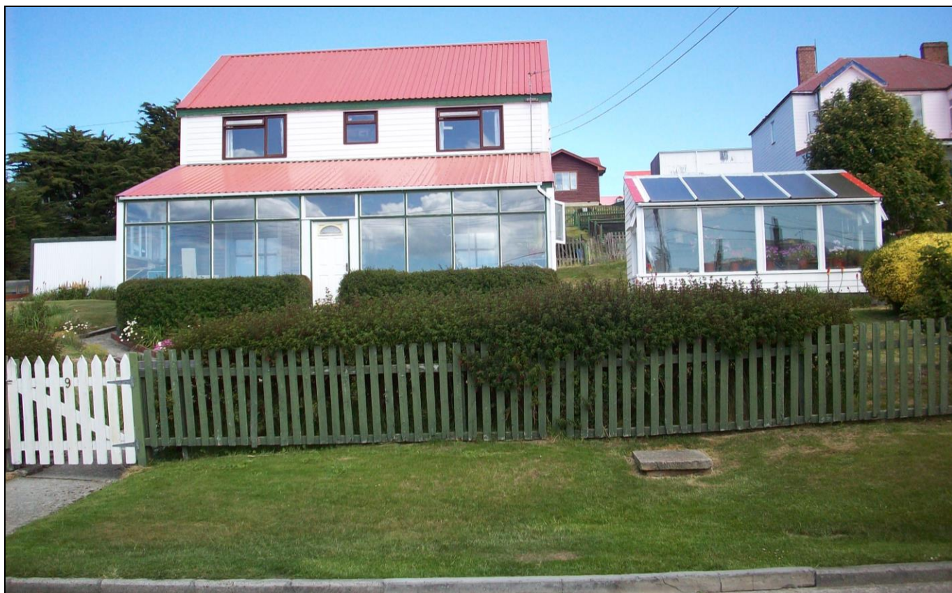
9 Fitzroy Road, 2016 - JCNA

In 1944, 9 Fitzroy Road consisted of a house and garage, had a rateable value of £52 and was occupied by the owner, Mrs E DAVIS . [BUS/RAT/2#1]