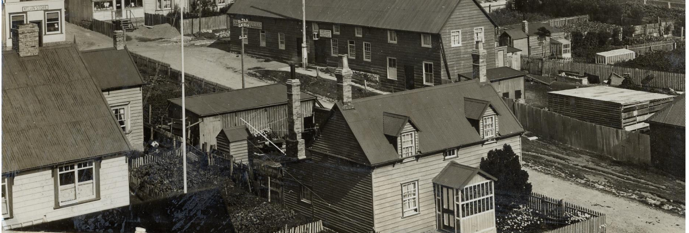
Early 1927 – L-R: Corner of Church House, garden now where McIntosh's house stood, Bott's or Hannaford's House – photo FIC collection

By 1927 the original house had been demolished and the house which stands today was built.