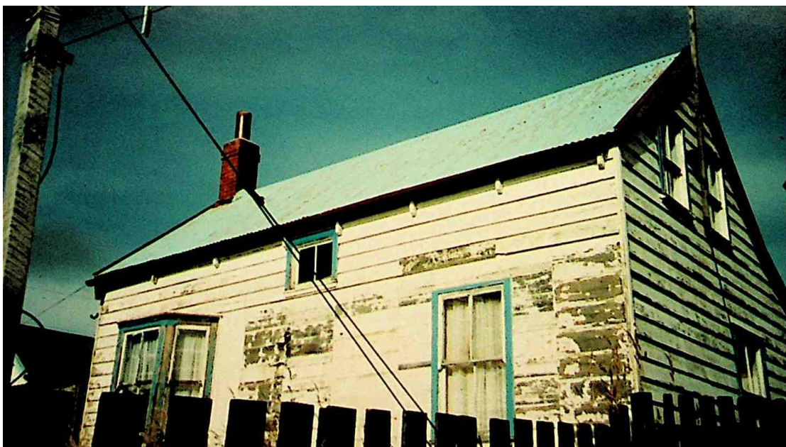
1990s