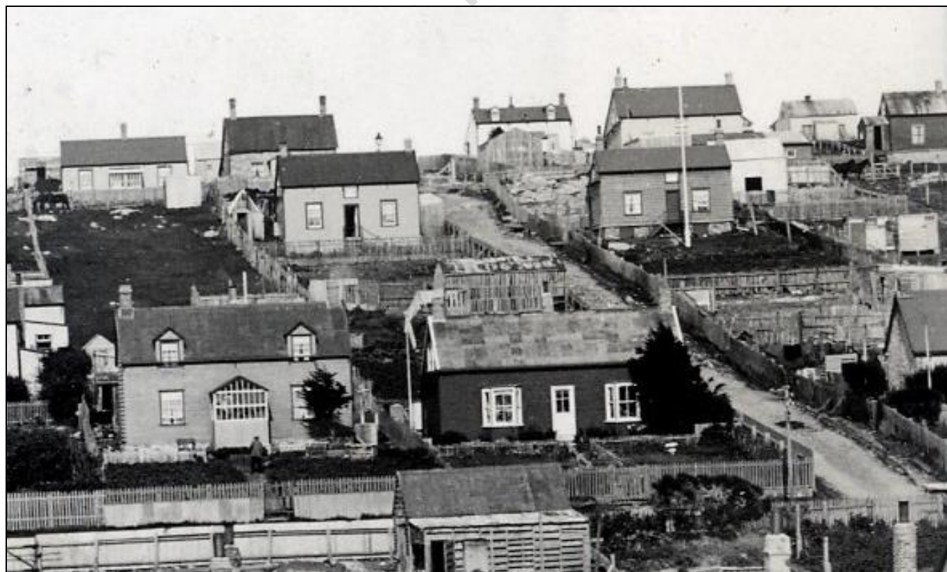
L-R: 25 Fitzroy Road and 23 Fitzroy Road with 2 Dean Street to the rear of No 23, 1927