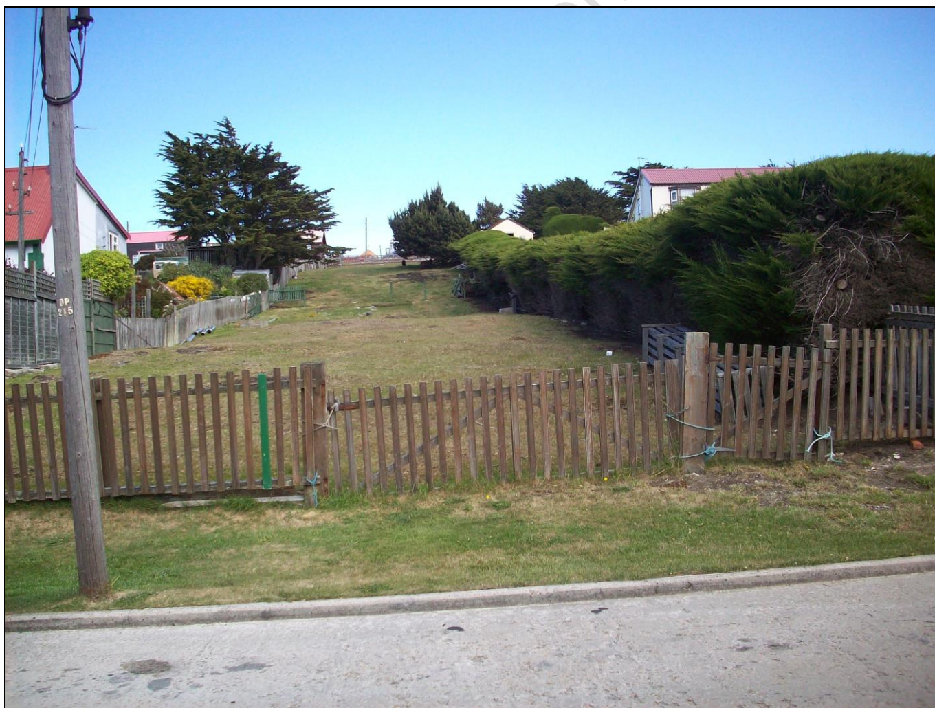
2016 - JCNA