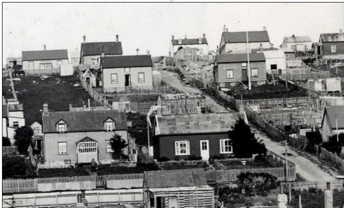
L-R: 25 Fitzroy Road and 23 Fitzroy Road in 1927