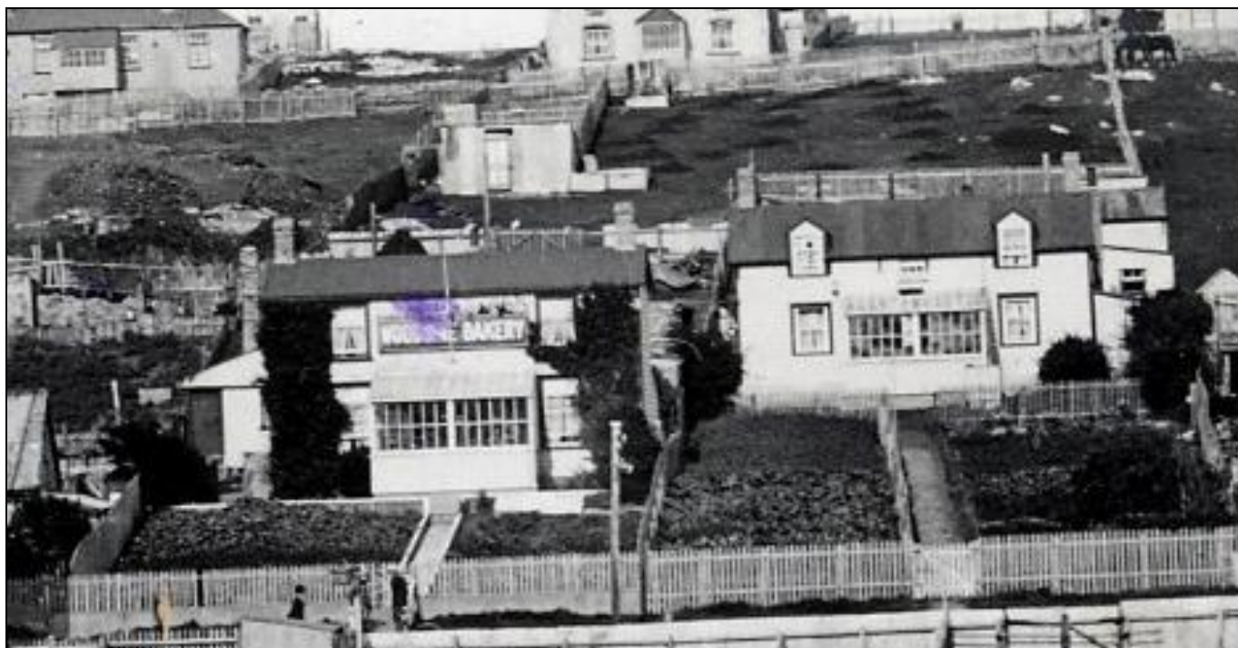
L-R (east to west) 29 Fitzroy Road, and 27 Fitzroy Road 1927