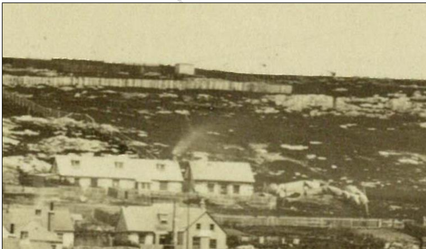
L-R (east to west) to rear: 33 Fitzroy Road and 31 Fitzroy Road, 1870s