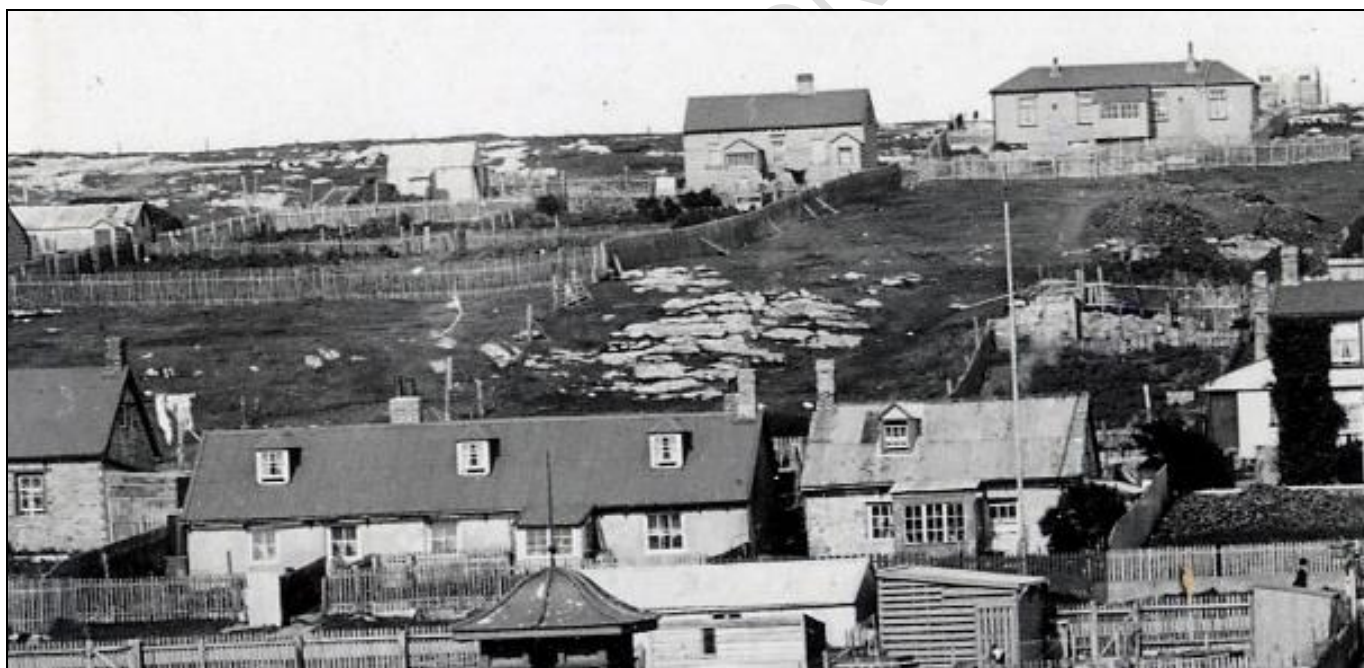
Front centre L-R: 33 Fitzroy Road and 31 Fitzroy Road in 1927