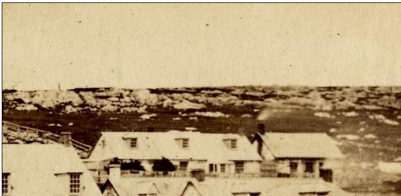
L-R (east to west) to rear: 33 Fitzroy Road and 31 Fitzroy Road, December 1878