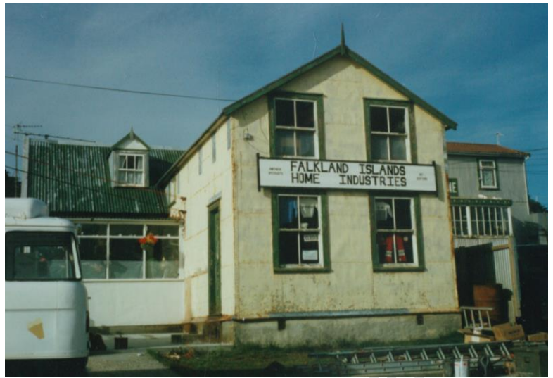
31 Fitzroy Road, 1997 - JCNA