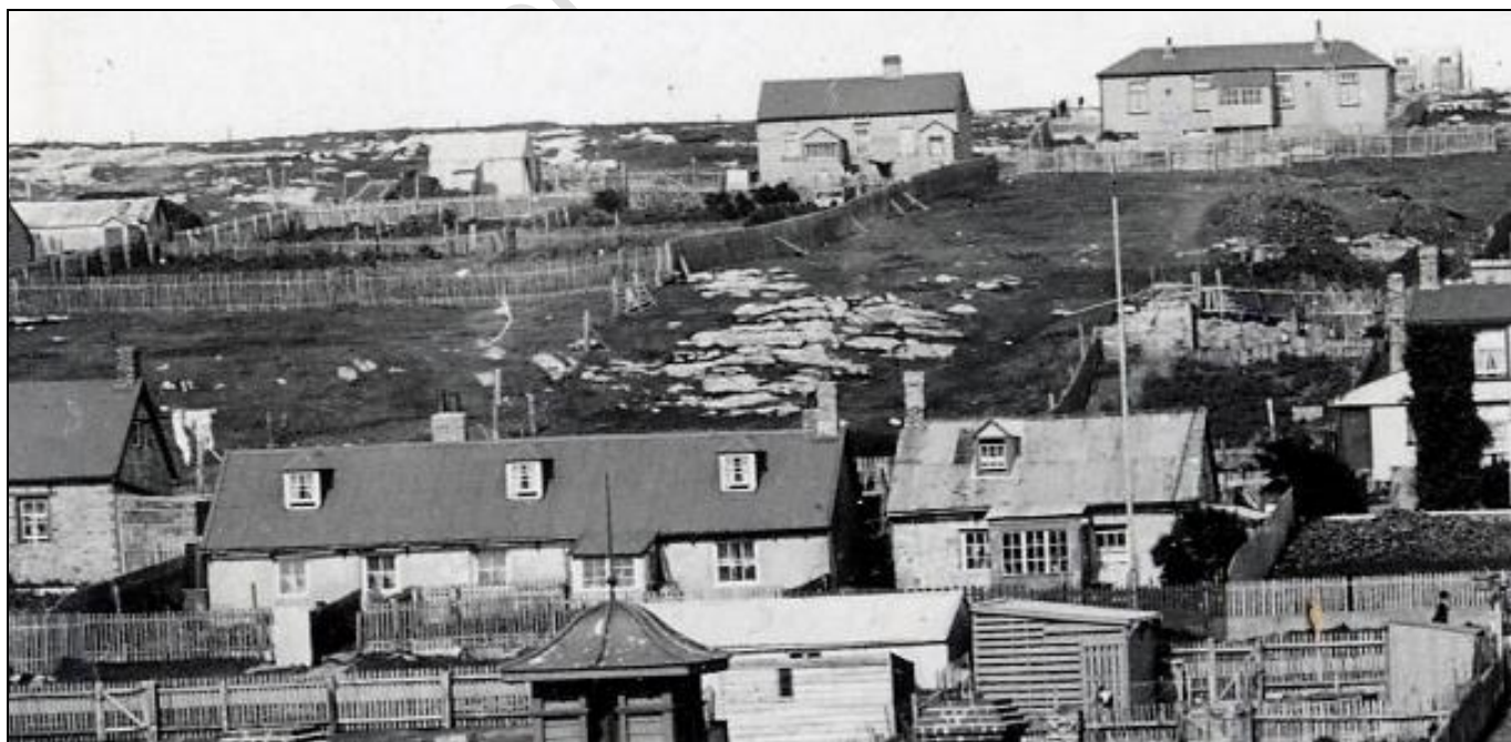
Front centre L-R: 33 Fitzroy Road and 31 Fitzroy Road in 1927