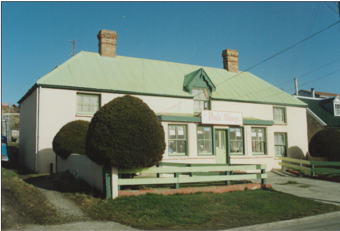
33 Fitzroy Road 1992 - JCNA

In June 1976 33 Fitzroy Road belonged to Mr & Mrs E COFRE of Weddell Island and consisted of six bedrooms, lounge, kitchen and bathroom as well as a garage and workshop on approximately quarter of an acre of land. They offered it to the Falkland Islands government for £4,500. The report by PWD advised purchasing the house due to extreme dampness, rotted, floor boards, joists and joinery, and old lead wiring which needed complete renewal. [HOU/1#6]