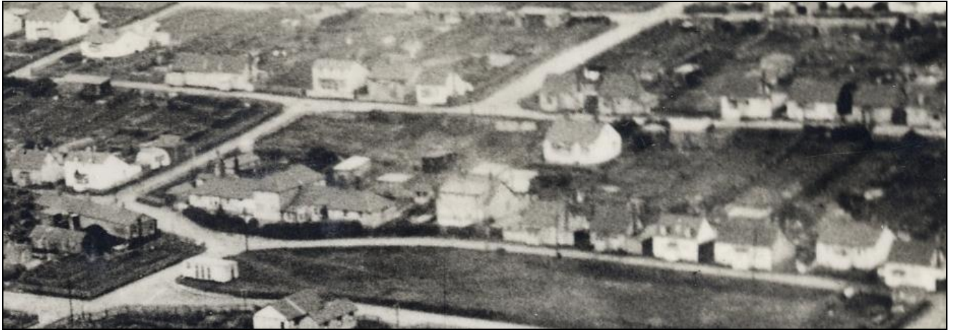
Late 1940s – Seventh house from right, top row