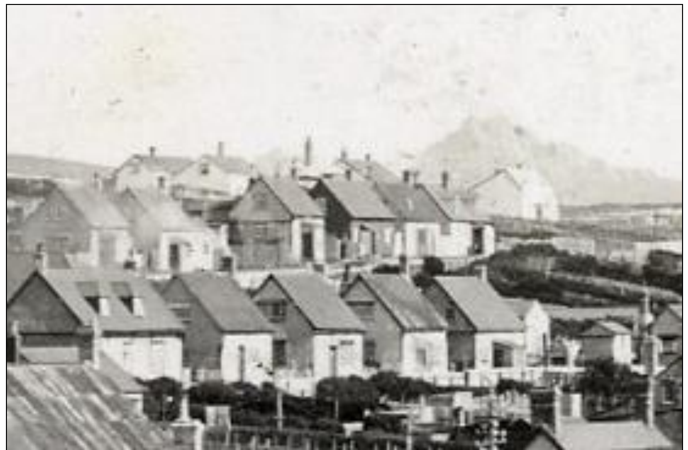
Early 1927 – Space to right of front row of houses