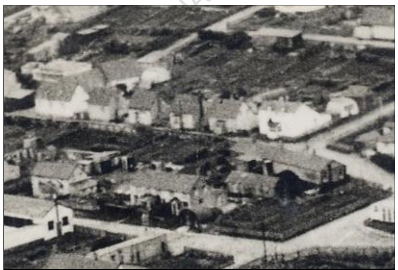
Late 1940s – Showing the new house, first house from right top row