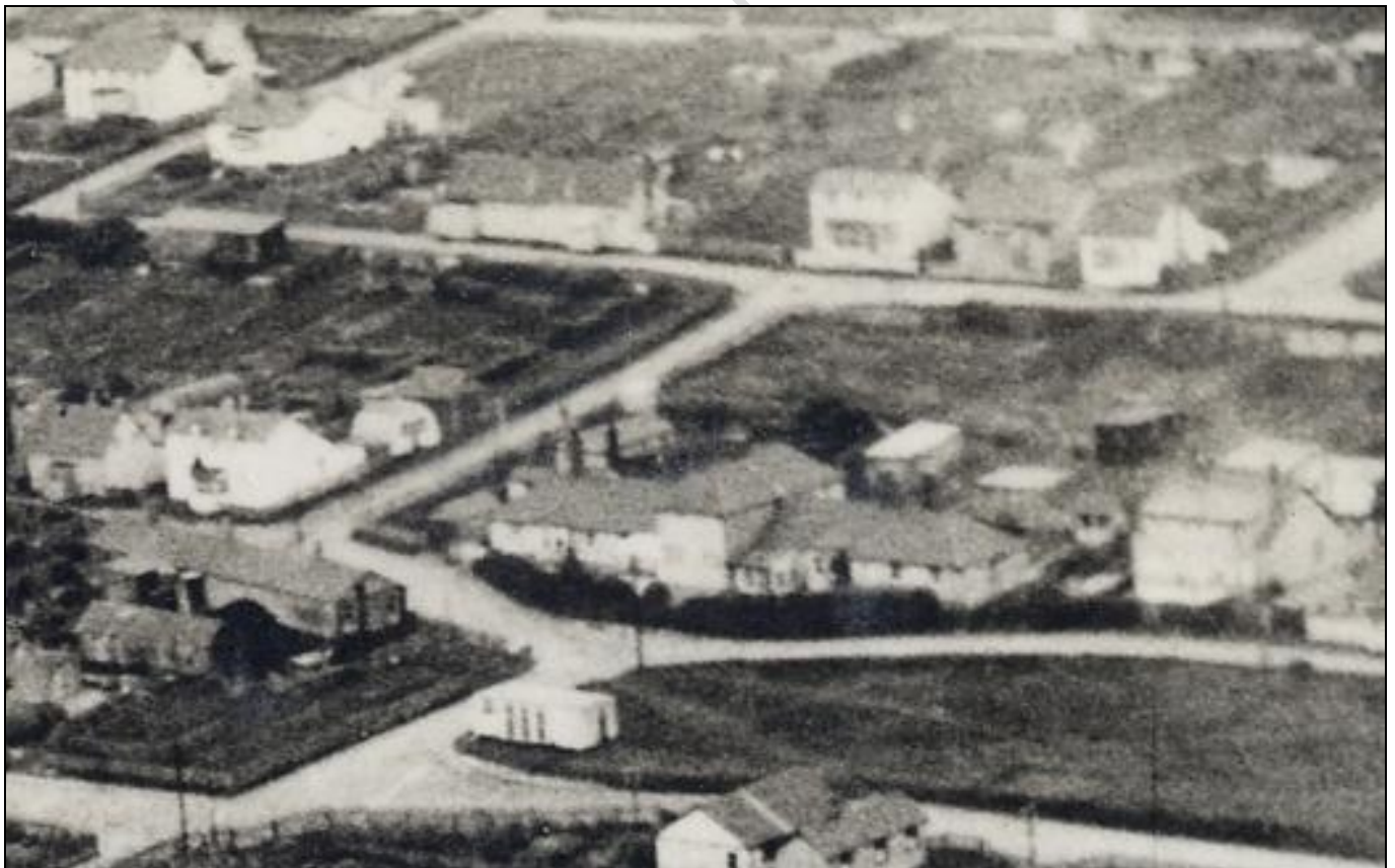
Late 1940s – Third house from right, top row