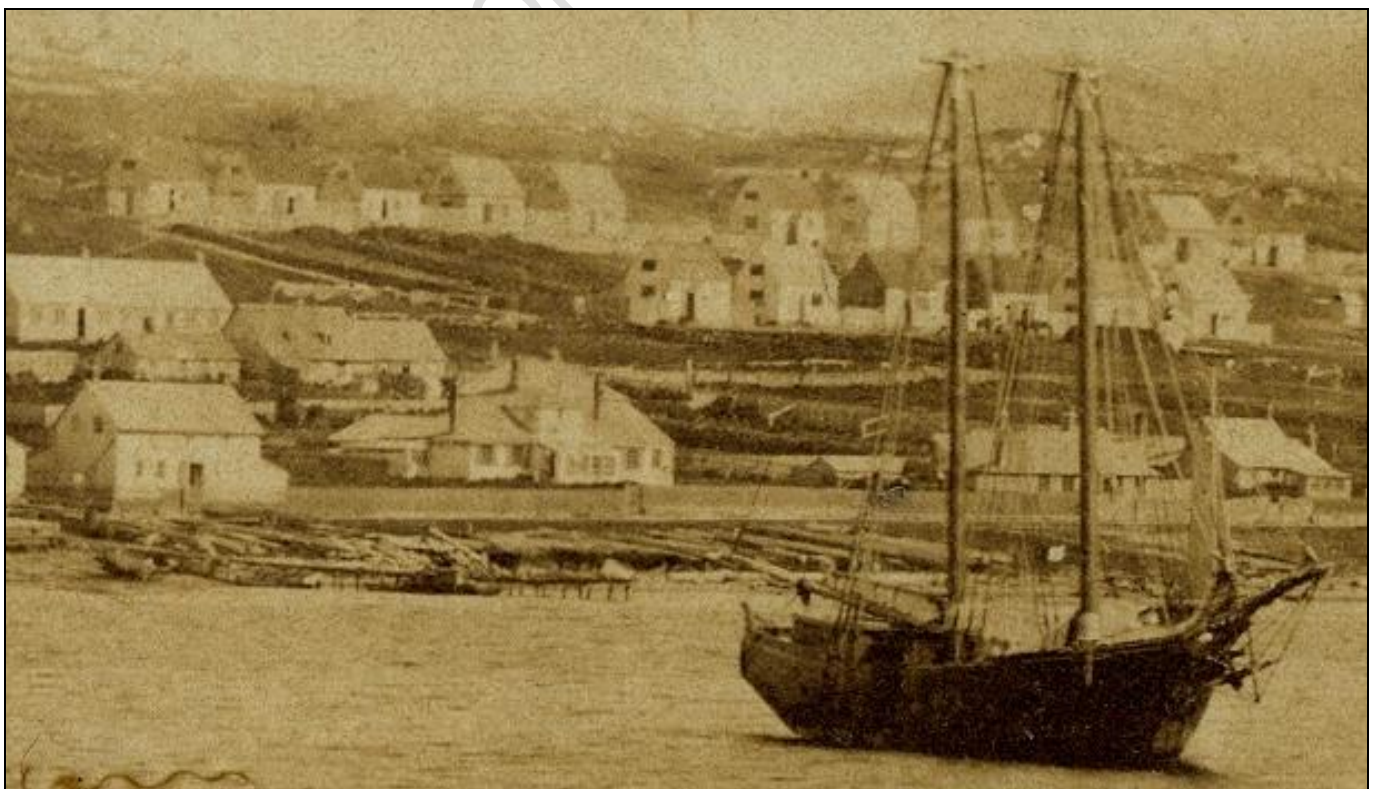
1863 – Sixth house from the left, top row

On 20 June 1857 Thomas HAVERS , Colonial Manager of the Falkland Islands Co Ltd and of Stanley, granted to the Falkland Islands Company Limited “All those suburban Lots No 7 in Pensioners Special Allotments and No 24 in Pensioners Cottage Allotments together containing Ten Acres and Twenty four poles more or less and all houses walls or buildings and crops of what kind so ever in upon or about the said premises” . [BUG-REG-1; 166]