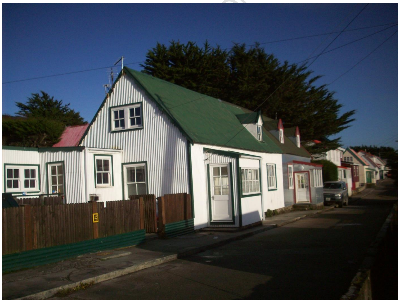
2019 - Left-hand half of semi-detached house

On 27 February 1998, 15 Pioneer Row was gazetted as being a building or structure in the Falkland Islands designated as being of architectural or historic interest.