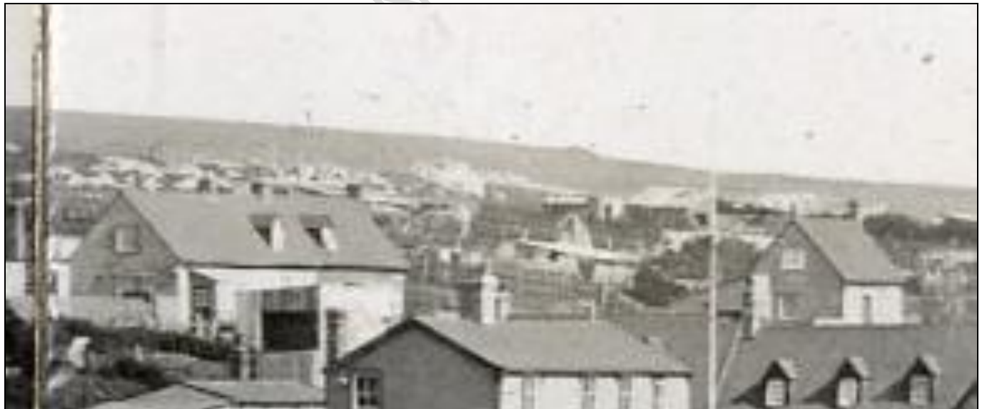
Early 1927 – Left-hand half of semi-detached house back-left is on PCA 27