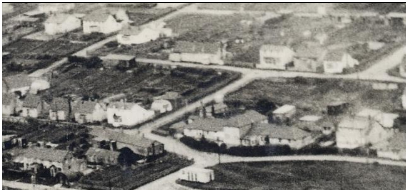
Late 1940s – Top row; the house on Lot 27 is semi-detached and Lot 28 is bare

On 27 February 1998, 15 Pioneer Row was gazetted as being a building or structure in the Falkland Islands designated as being of architectural or historic interest.