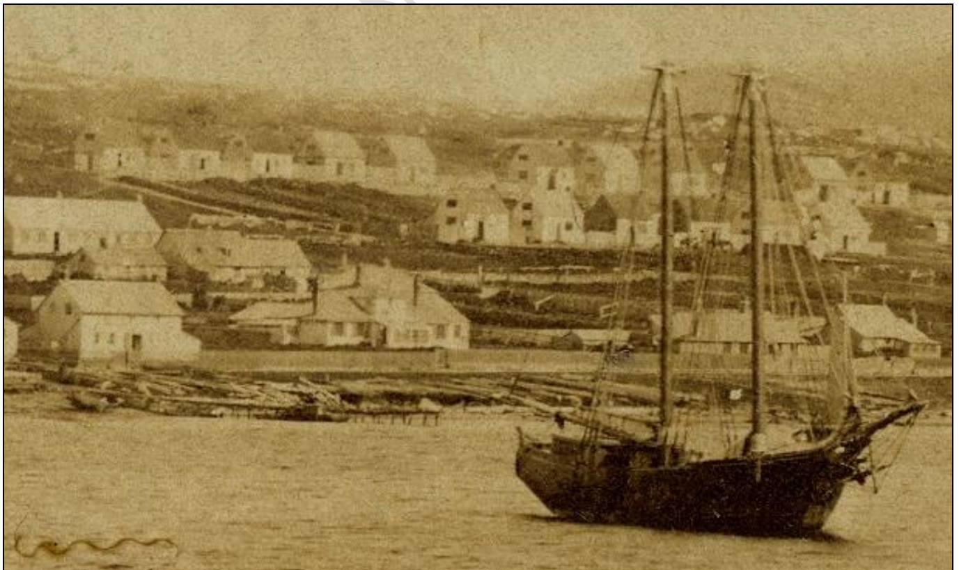
1863 – Fourth house from the left, top row