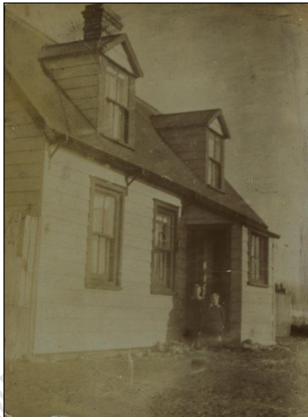
Fair View Cottage 1915

On 1 January 1917 Fair View Cottage was insured for £80.