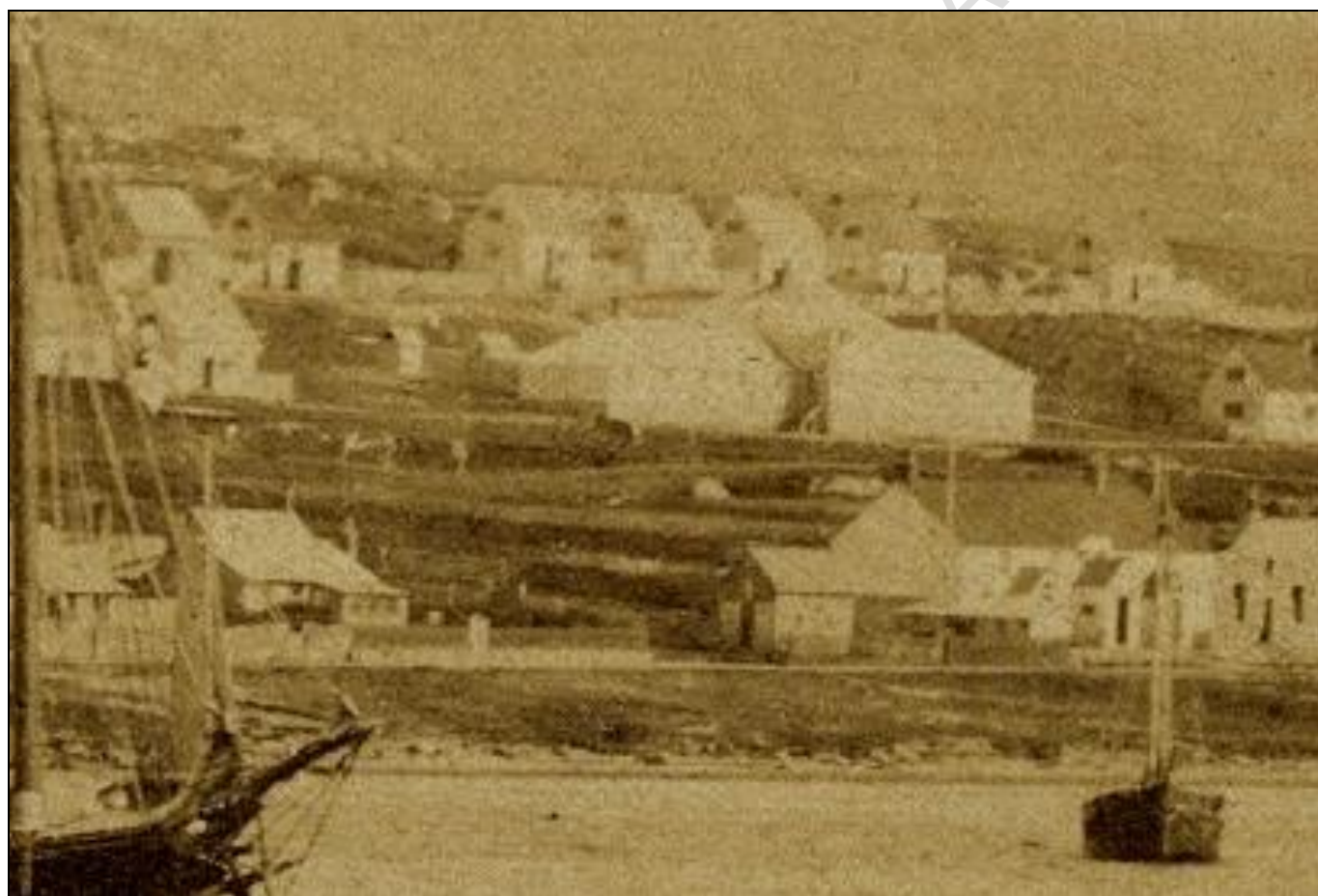
1863 – Second house from the right, top row