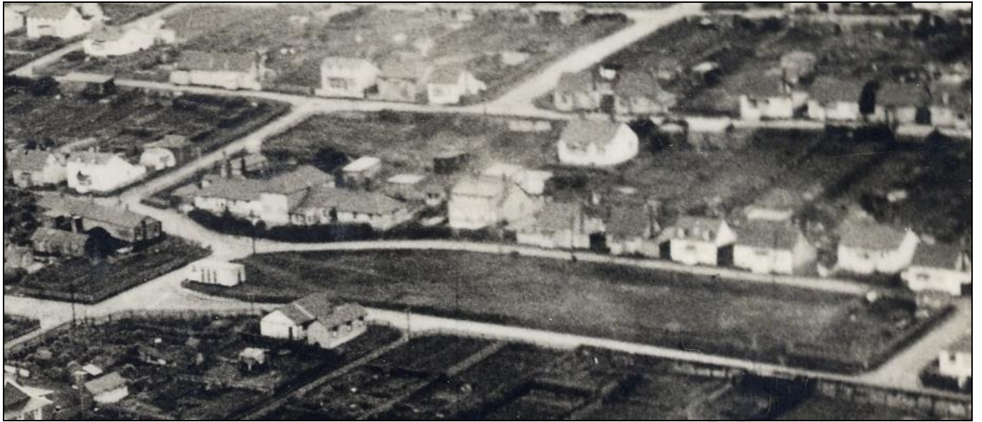
Late 1940s – First house from the right, top row