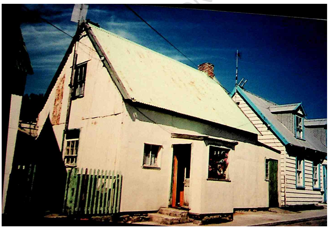
1994 – 4 Pioneer Row

On 12 September 2002, 4 Pioneer Row was gazetted as being a building or structure in the Falkland Islands designated as being of architectural or historic interest.