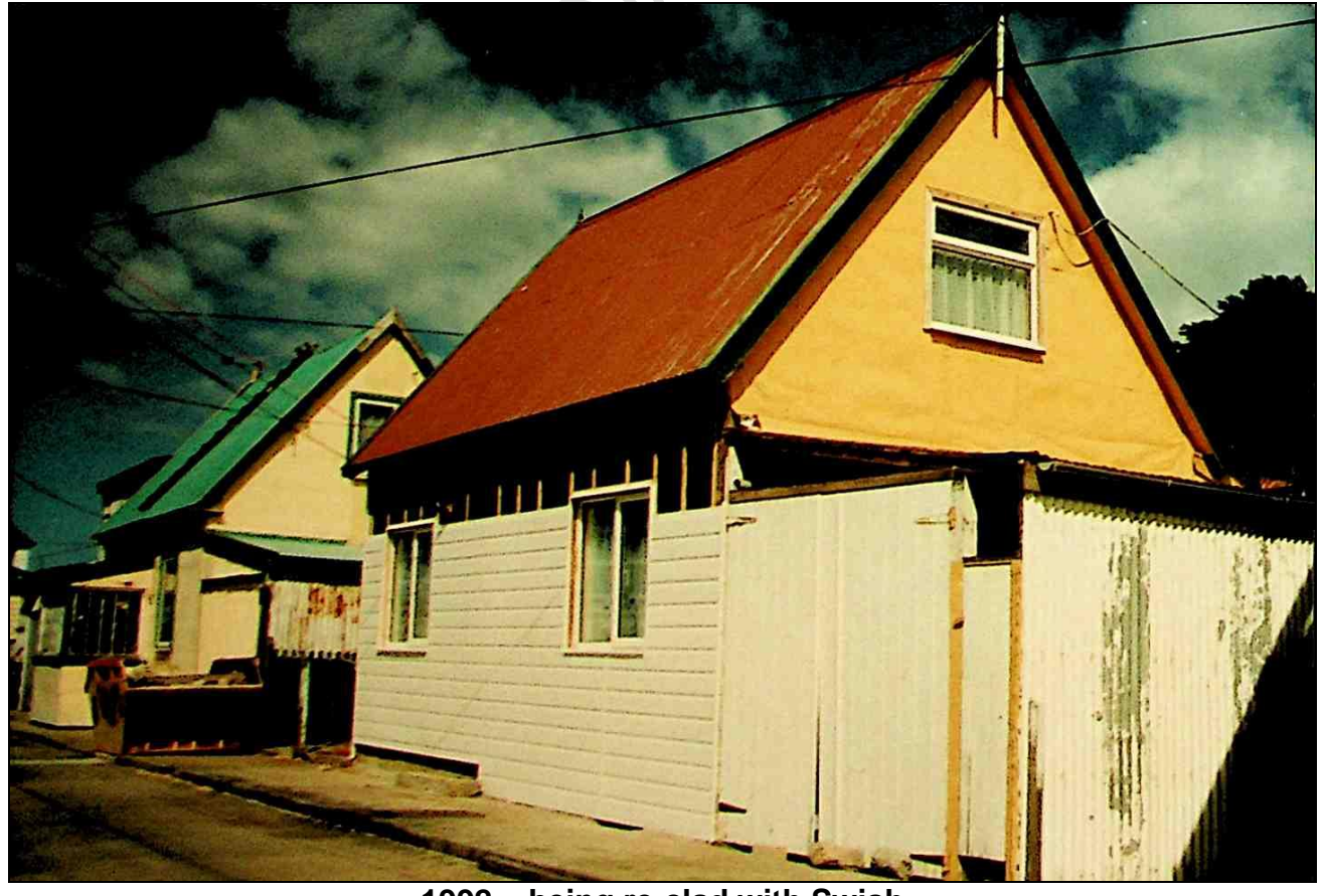
1992 - being re-clad with Swish