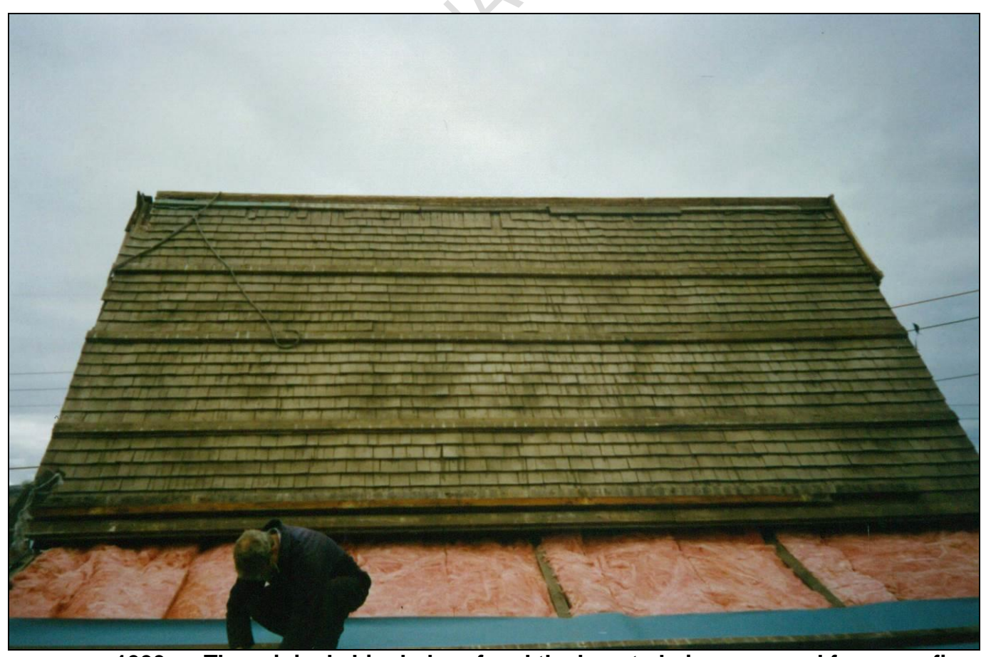
1990s – The original shingled roof and the lean-to being prepared for re-roofing